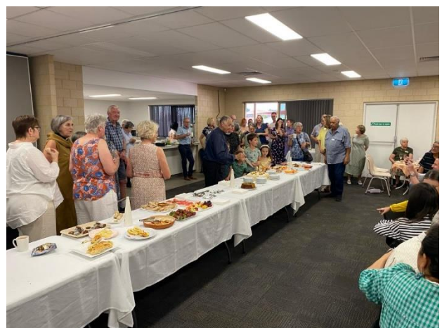
30 th Anniversary Celebration Brunch (and cake!)