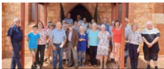
St Andrew's Mullewa Centenary, November 2021

For more news about the North West visit anglicandnwa.org | @northwestanglicans or sign up to receive the North West Network magazine