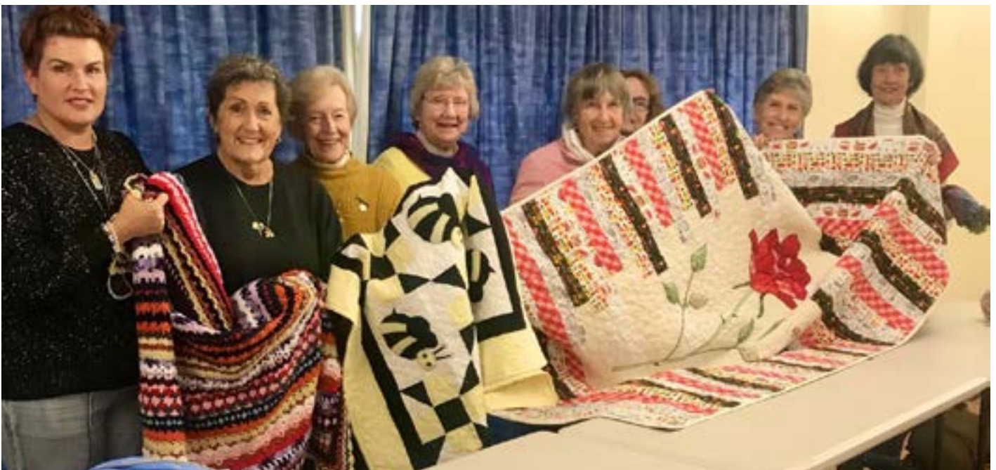
St Swithun's Anglican Church handmade quilt donation - one of the many Anglican supports St Bart's has been privileged to receive this year.

For more information on St Bart's services, please visit stbarts.org.au or get in touch with us by calling 9323 5100 .