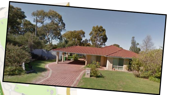
Rectory 2 Lessing Place South Lake