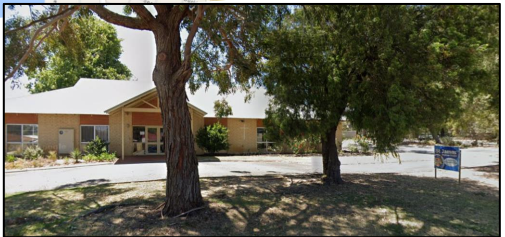
St James Church 13-15 Elderberry Drive South Lake