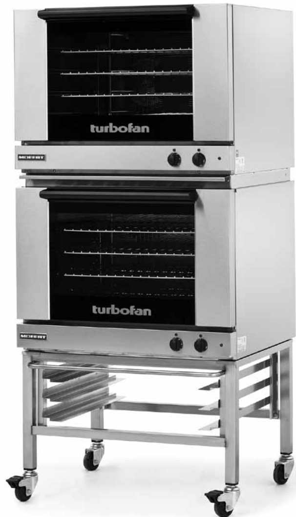
Model E28M4/2C shown