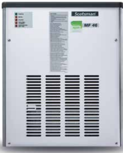
Nugget ice 1g – Ø11mm x H 13mm