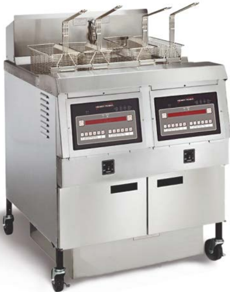
OFG 322 2-well gas open fryer with Computron™ 8000 control

Henny Penny open fryers offer high-volume, integral multi-well frying with programmable operation, oil management functions and fast, easy filtration.