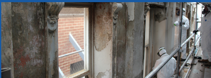
Hazardous material removal