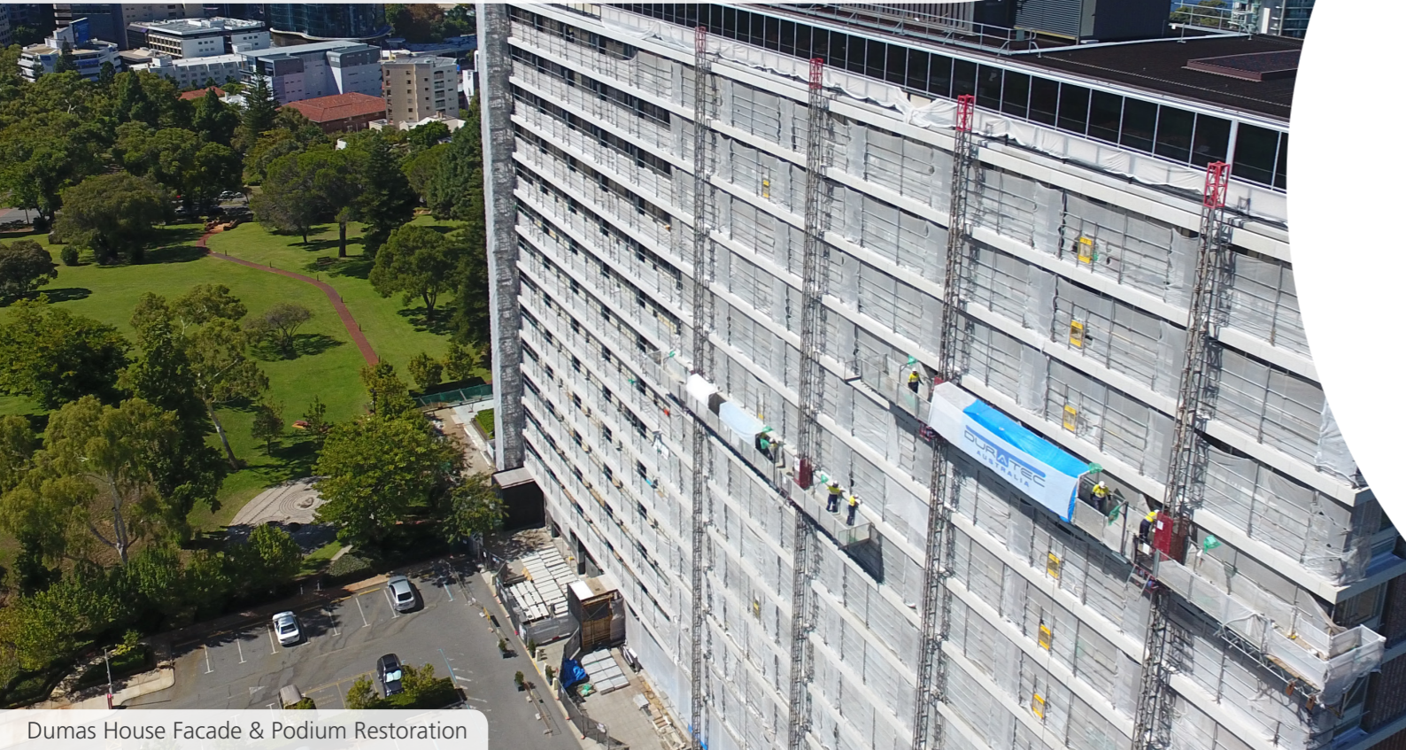
Dumas House Facade & Podium Restoration