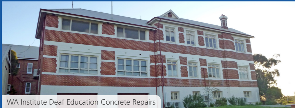
WA Institute Deaf Education Concrete Repairs