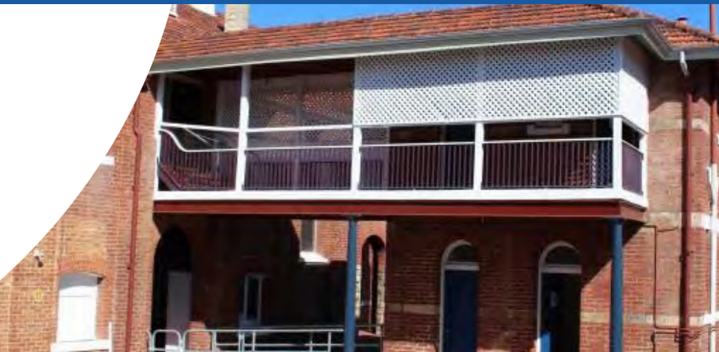
Fremantle Artillery Barracks Balcony Remediation