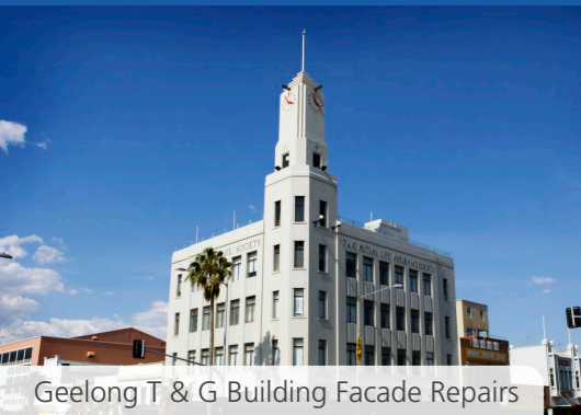
Geelong T & G Building Facade Repairs