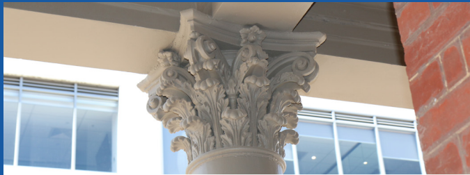
Architectural feature repairs