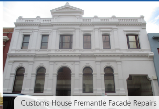
Customs House Fremantle Facade Repairs