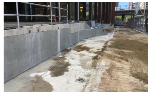
Overview of podium slab work area.