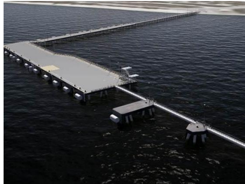
Proposed wharf extension render