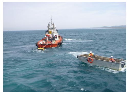
Dredging to remove high points in berthing pocket