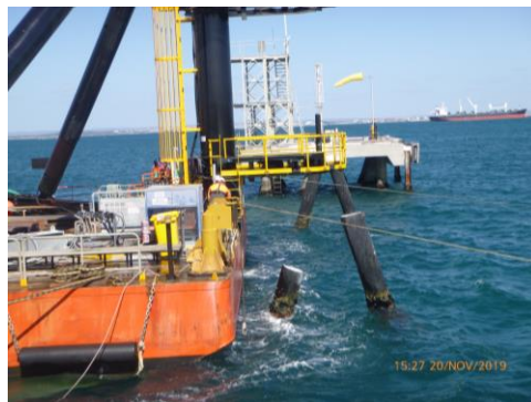
Removal of existing walkway and piles to existing Dolphin.