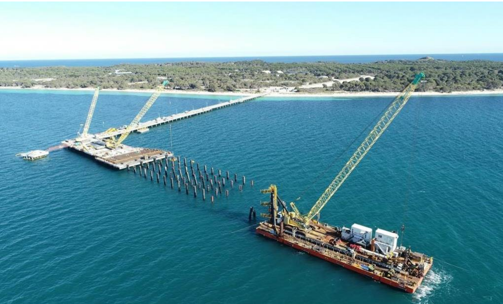
Wharf construction in progress