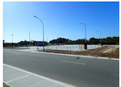
Completed maintenance hardstand area