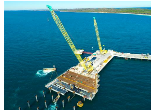
Wharf construction in progress