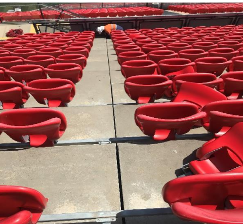
Joint sealing preparation underway.