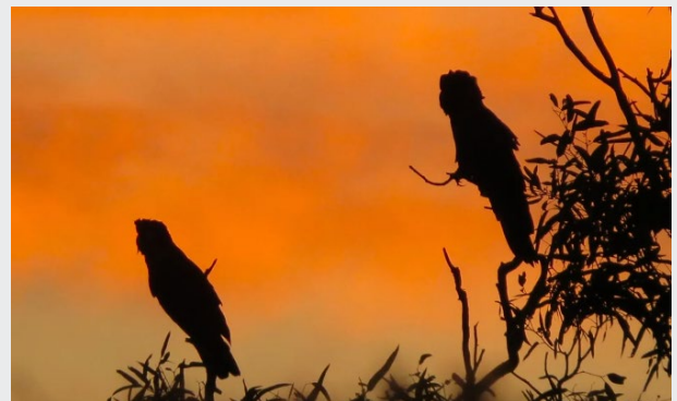
Image: Silhouette of Carnaby's Black Cockatoos spotted during the Great Cocky Count.

The program aims to protect and restore the habitat of this iconic bird. The Great Cocky Count is an annual event supporting conservation efforts for these cockatoos as they face significant threats. This year, the NACC NRM team partnered with BirdLife WA to set up roosting sites, one in the Shire of Irwin and another in Chapman Valley, to count and observe the cockatoos.