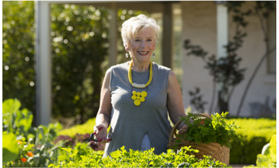
Maggie Beer is ready to tackle the challenge of improving food in residential aged care.

Aged Care Advocacy Newsletter | August 2023 | Issue 7