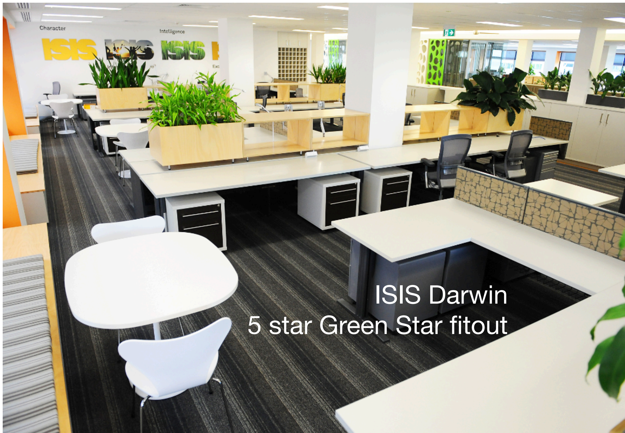
ISIS Darwin 5 star Green Star fitout