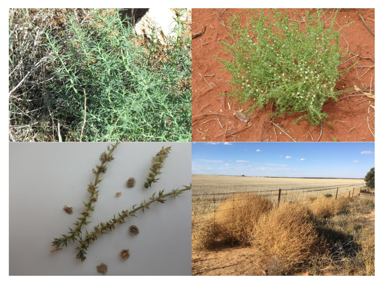
Image 2 – A young roly poly in the juvenile vegetative growth stage, with long, soft, succulent leaves (top left), a mature roly poly with short, prickly leaves and fruit (top right), a close up of roly poly branches with fruit starting to shed (bottom left) and dead roly poly (bottom right).

This species is commonly confused with black roly poly ( Sclerolaena muricata ), which has spiny burrs and is generally hairier. It may also be confused with kochia ( Kochia scoparia ) and tumbleweed ( Amaranthus albus ).