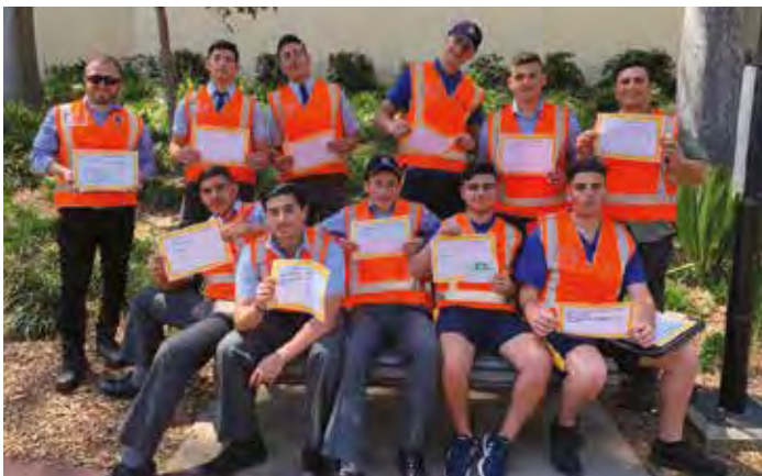
Students from Harris Park's Maronite College of the Holy Family learn about site safety with Parramatta Light Rail.

It was a fantastic chance for the students to go on site in a controlled environment, put on some personal protective equipment (PPE), and hear from people working on the light rail project about the importance of safety in construction as well as career opportunities.