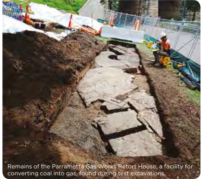
Remains of the Parramatta Gas Works Retort House, a facility for converting coal into gas, found during test excavations.

We are exploring opportunities to incorporate these finds into heritage interpretation on site to tell the story of the site, as well as working with the City of Parramatta Council and Aboriginal Land Council to repurpose any salvaged finds where we can.