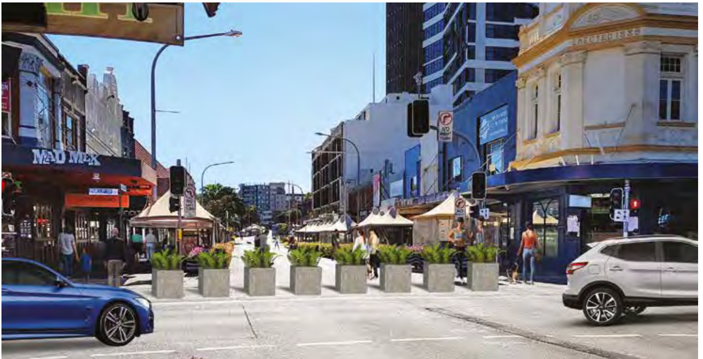
An artist's impression of what the 'Eat Street' section of Church Street, Parramatta, will look like from February 2020.

Parramatta Light Rail's construction plan for the Parramatta CBD has been announced, with innovative technology and inventive engineering to minimise impacts on local businesses.