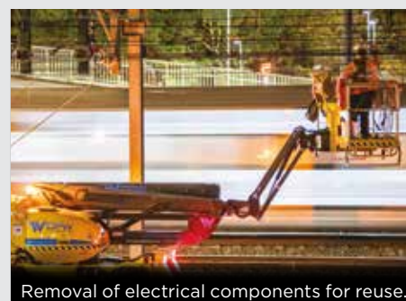
Removal of electrical components for reuse.

While some disruption is unavoidable, Transport for NSW is working hard to minimise the impacts of construction. We are working closely with the local community, residents and businesses to ensure they have the information and support they need during construction of the light rail.