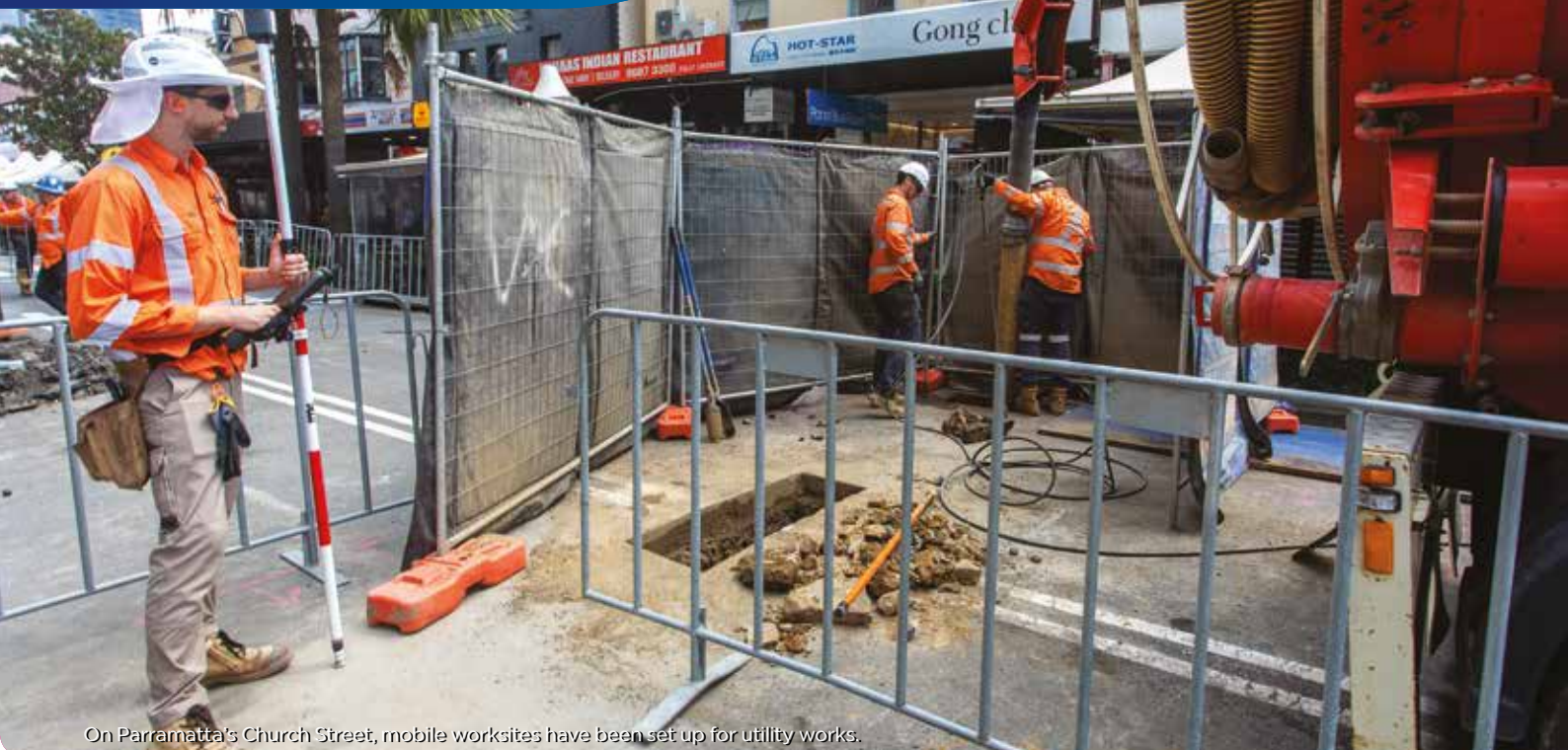
On Parramatta's Church Street, mobile worksites have been set up for utility works.