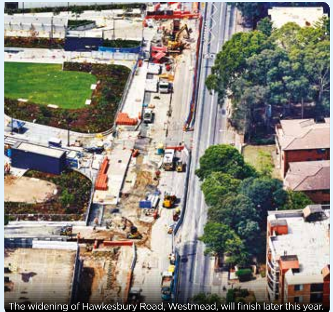
The widening of Hawkesbury Road, Westmead, will finish later this year.

In the Parramatta CBD , a state-of-the-art micro-tunnelling boring machine will be set up at Centenary Square to construct drainage to the Parramatta River. Using the tunnelling machine results in lower levels of noise and impact compared to digging at street level. On Macquarie Street, construction works such as traffic and lane changes will be implemented to accommodate construction work zones as they are set up on the road.