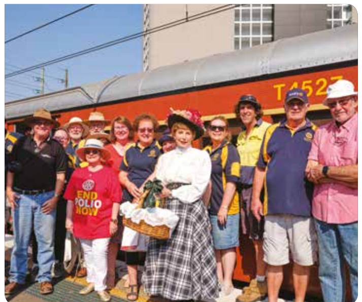
Members of the Carlingford Rotary Club joined in with the community to say farewell to the T6 Carlingford Line.