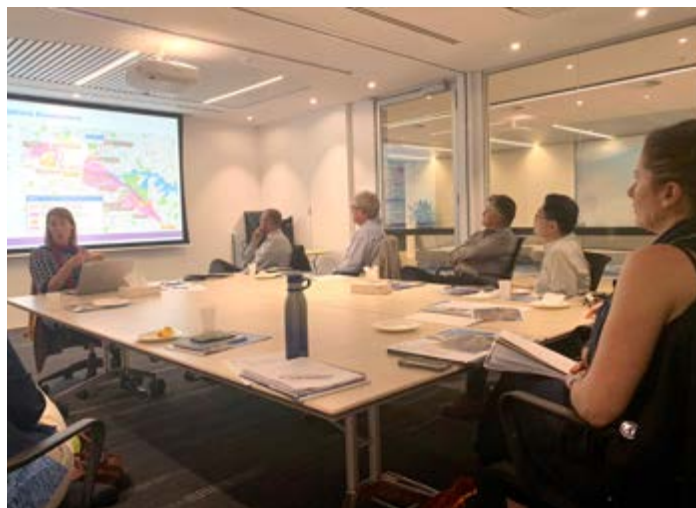
Above: members of the Parramatta Light Rail Stage 2 Community and Stakeholder Reference Group discuss the project.

Parramatta Light Rail Stage 2 will connect Parramatta CBD to Sydney Olympic Park through Ermington, Melrose Park and Wentworth Point.