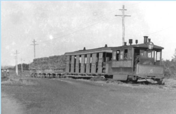
Grand Avenue, Camellia, c. 1930: a steam tram with one passenger car and four goods wagons headed for Parramatta, loaded with bagged linseed for Meggitt's Linseed Oil Factory, established in Parramatta in 1908.

“The old Parramatta Park to Redbank Wharf tramway [which operated from 1883-1943] ran down George Street through the Camellia district. People living along the route used to give their weekly grocery orders to the tram conductor!”