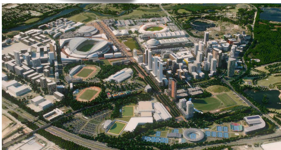
Sydney Olympic Park Master Plan 2030

It will be further developed and informed by consultation with the community and stakeholders, including a final decision on whether the route will go through Rydalmere or Camellia.