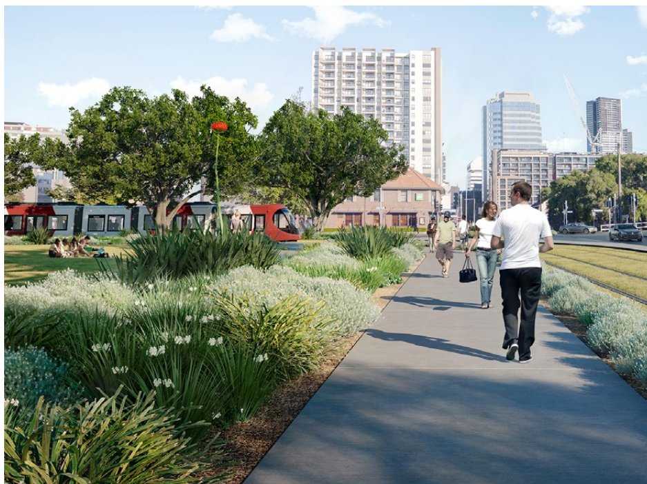
Artist's impression of light rail at Robin Thomas Reserve

Stage 1 of Parramatta Light Rail will link Westmead to Carlingford via Parramatta CBD and Camellia, connecting the Westmead Precinct, the new Western Sydney Stadium, the new Powerhouse Museum, three Western Sydney University campuses and communities at Camellia and Telopea.