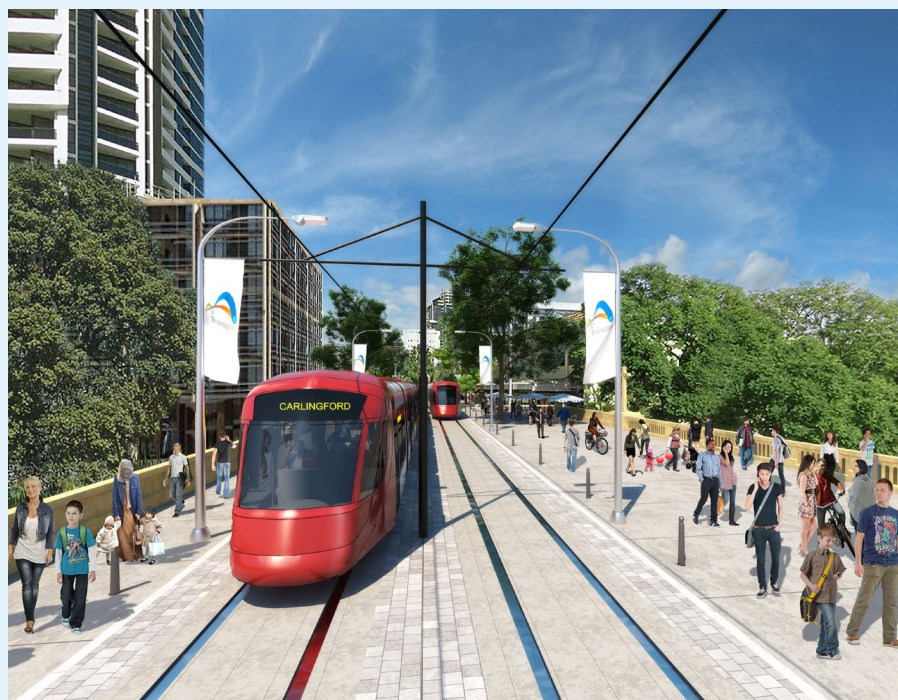
Above: Artist's impression of light rail at Lennox Bridge, Parramatta.

Members will advise on activities for precincts including Westmead, North Parramatta, the Parramatta CBD, Eat Street and the Camellia to Carlingford line.