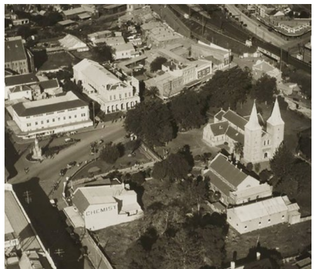
Church Street, Parramatta, aerial view of St. John's Church, Town Hall, Memorial Clock and railway line, circa 1930. (LSP00381)