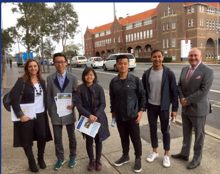
Parramatta Light Rail staff members tour the proposed route with entrants from the Transport for NSW Sustainable Design competition.

The project is proud of its focus on sustainability, which includes leading the Transport for NSW Sustainable Design competition, open to final-year university students (below), with results to be revealed later this year at www.parramattalightrail.nsw.gov.au .