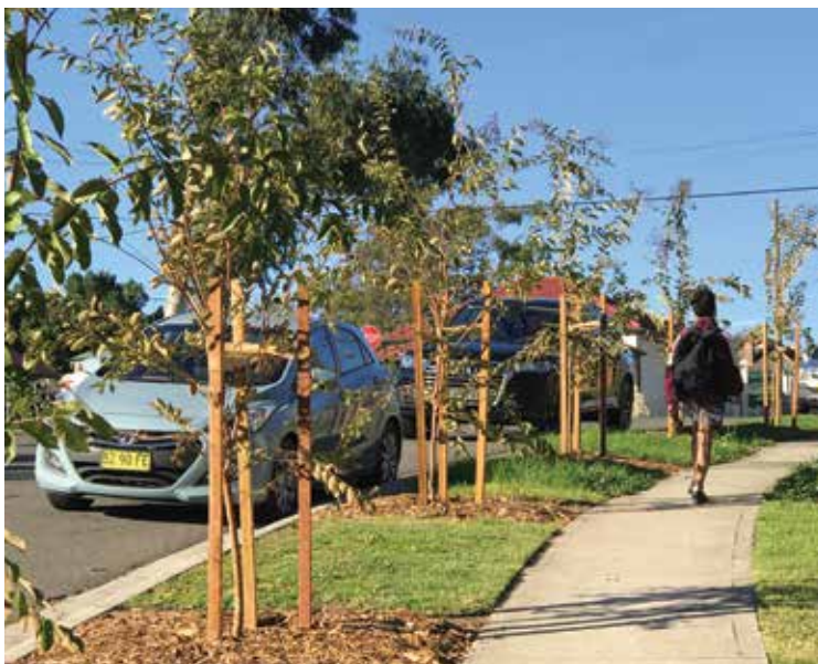
New trees along Barney Street, North Parramatta.

The Parramatta Light Rail Tree Planting and Neighbourhood Improvement program, in partnership with the City of Parramatta, will see at least 2500 new native and exotic trees planted in streets, parks and reserves. Separately, Transport for NSW expects to plant a further 1000 to 1500 trees across the project. The new trees provide shade, improve air quality and make streets significantly greener. For more information, visit parramattalightrail.nsw.gov.au/trees .