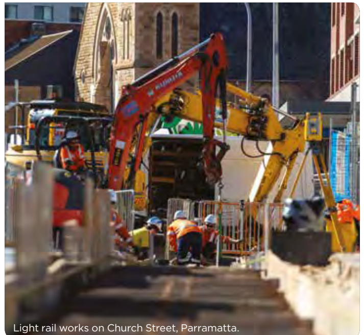
Light rail works on Church Street, Parramatta.

A celebration of the completion of major construction, known as 'Eat Street Uncovered', will now take place from August 2021 before the second phase of light rail works – installation of light rail stops, testing and commissioning – begins. Light rail tracks are expected to be laid in January.