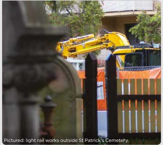
Pictured: light rail works outside St Patrick's Cemetery.

Archaeological testing outside the modern-day bounds of Parramatta's historic St Patrick's Cemetery has led to design adjustments – including a custom-made shallow pavement and construction methods that minimise ground excavation – to ensure that recent light rail construction works did not disturb five suspected burial sites from earlier phases of the cemetery, as its boundaries have shifted over the decades.