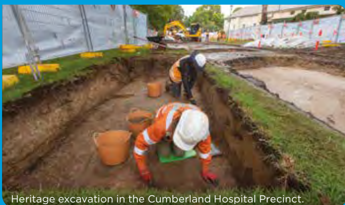
Heritage excavation in the Cumberland Hospital Precinct.

In early 2021, tracks will be laid near the future Cumberland Hospital Precinct light rail stop. This area will be wire free and feature 'green track' to preserve its heritage character.