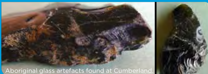
Aboriginal glass artefacts found at Cumberland.