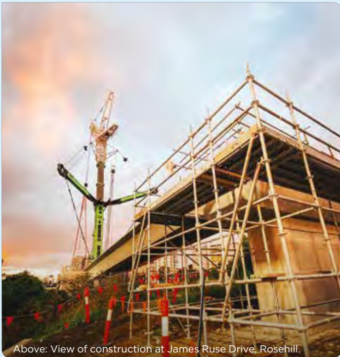
Above: View of construction at James Ruse Drive, Rosehill.

A new 417-tonne steel arch bridge – the biggest on the project – is under construction over James Ruse Drive at Rosehill (pictured, below).