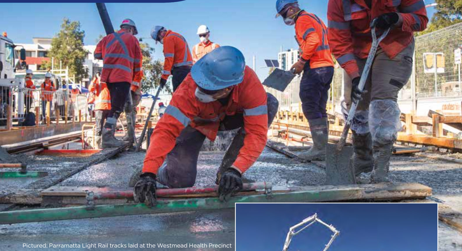
Pictured: Parramatta Light Rail tracks laid at the Westmead Health Precinct