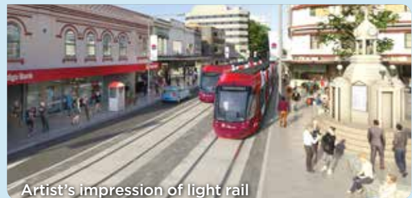
Artist's impression of light rail

Light rail through the Cumberland Hospital Precinct will be wire free, meaning no poles or overhead wires, which will assist in preserving the heritage values of the area. Green track, where grass and shrubs are planted within and beside light rail tracks, will also form a key component of the sympathetic design through this important precinct.