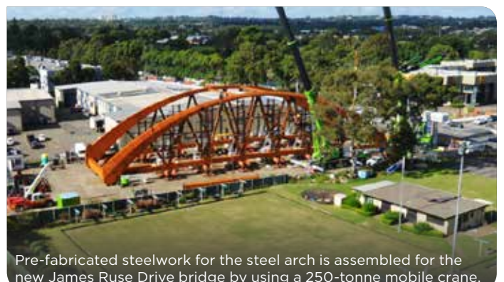
Pre-fabricated steelwork for the steel arch is assembled for the new James Ruse Drive bridge by using a 250-tonne mobile crane.