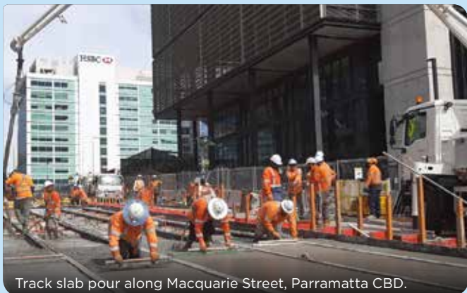
Track slab pour along Macquarie Street, Parramatta CBD.

The Parramatta Light Rail team has laid over 1.5 kilometres of track along the alignment so far. You can keep up to date with the progress of tracks laid with our online tracker at parramattalightrail.nsw.gov.au