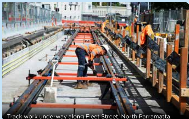
Track work underway along Fleet Street, North Parramatta.