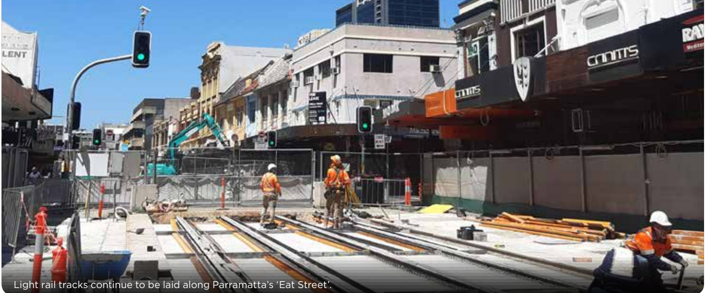
Light rail tracks continue to be laid along Parramatta's 'Eat Street'.

A celebration is planned after major construction is complete, with a Transport for NSW activation known as 'Eat Street Uncovered' to take place before the commencement of network testing and commissioning.