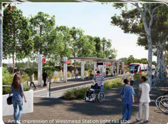
Artist impression of Westmead Station light rail stop.

For the first time, the images showcase the future Westmead Station, where light rail will start and stop its journey, as well as the wire-free section through the Cumberland Hospital Precinct, which will also feature 'green track', where grass is grown in and around the light rail track.