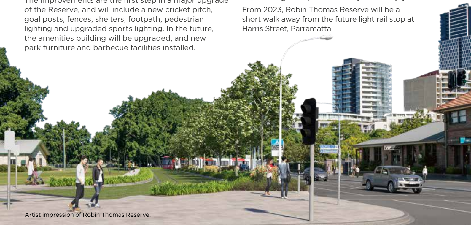
Artist impression of Robin Thomas Reserve.

From 2023, Robin Thomas Reserve will be a short walk away from the future light rail stop at Harris Street, Parramatta.