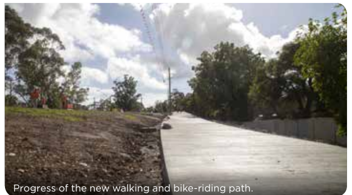
Progress of the new walking and bike-riding path.

In Rosehill , work continues on the construction of the biggest bridge on the project, which will span six lanes of traffic over James Ruse Drive and accommodate both light rail and active transport.