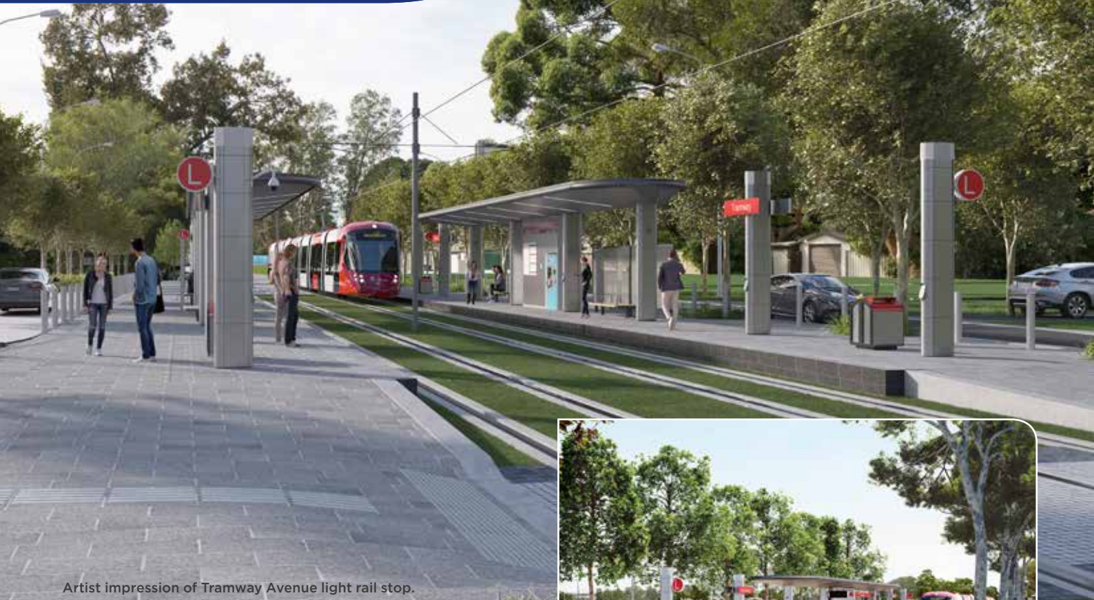
Artist impression of Tramway Avenue light rail stop.