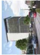
Arthur Phillip High School