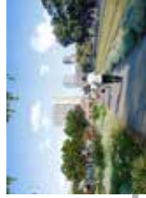
Robin Thomas Reserve