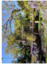
Wisteria Gardens