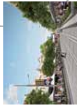
Eat Street Dining