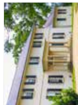
Old Government House