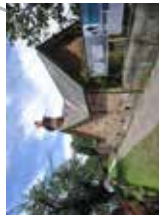
Female Factory