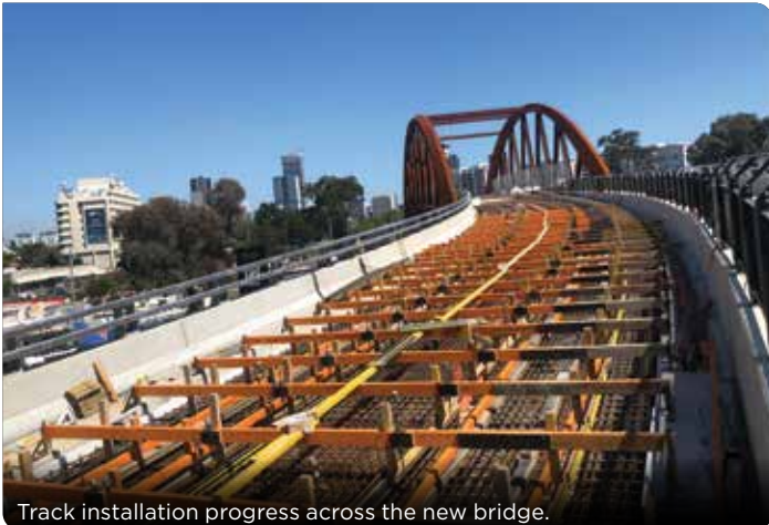
Track installation progress across the new bridge.

Transport for NSW will also reveal the name of the bridge shortly, after a panel of stakeholders met to consider more than 500 suggestions and determine a 'top five' list. We look forward to revealing the new name, which as a result of extensive consultation, will reflect the cultural, historical and social connections to the Greater Parramatta area.