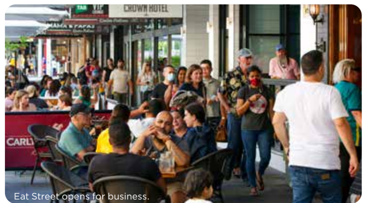
Eat Street opens for business.

The project worked with City of Parramatta Council to deliver an outcome for Eat Street that balanced the needs of local businesses and the community along with the safe operations of light rail.