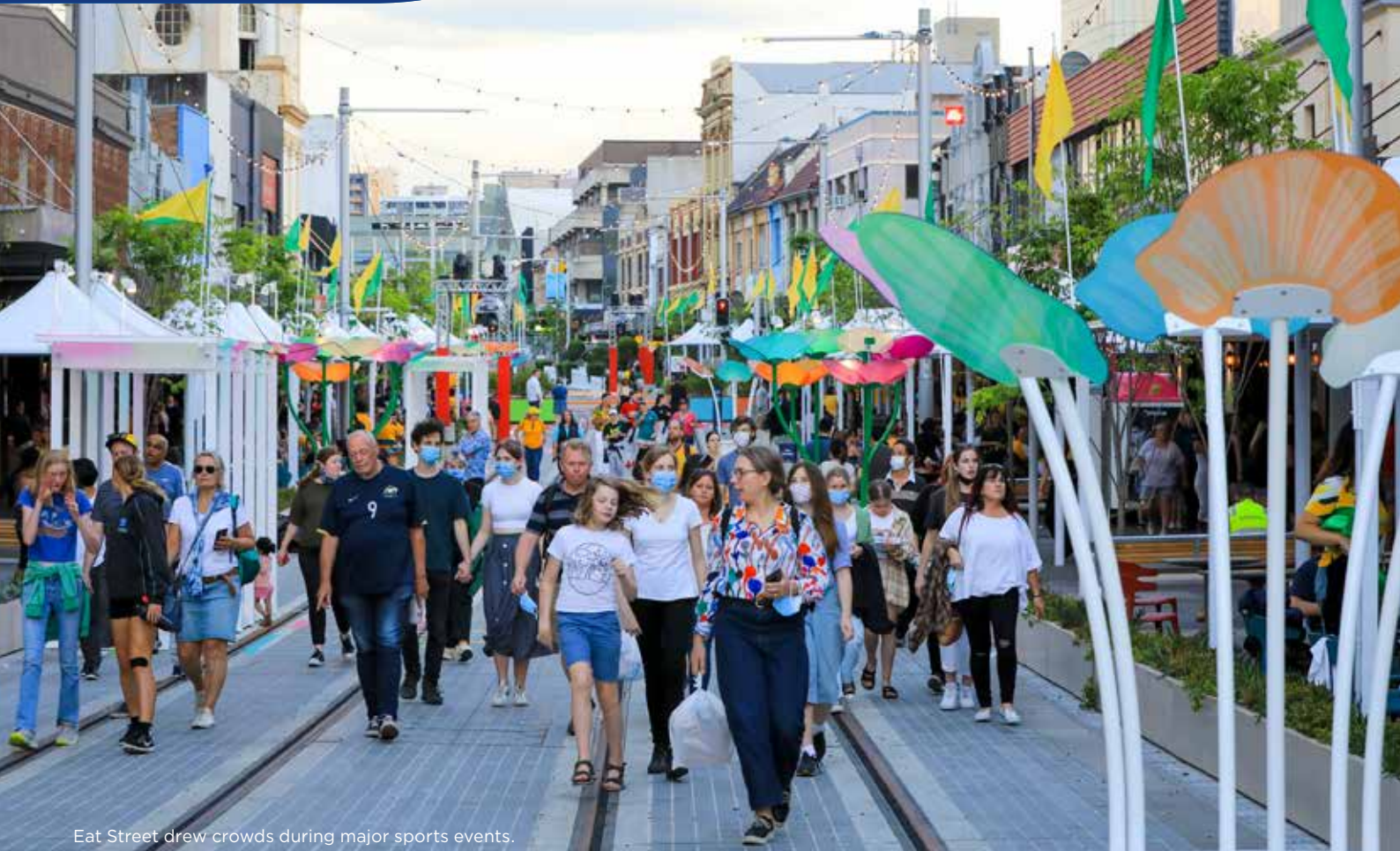
Eat Street drew crowds during major sports events.