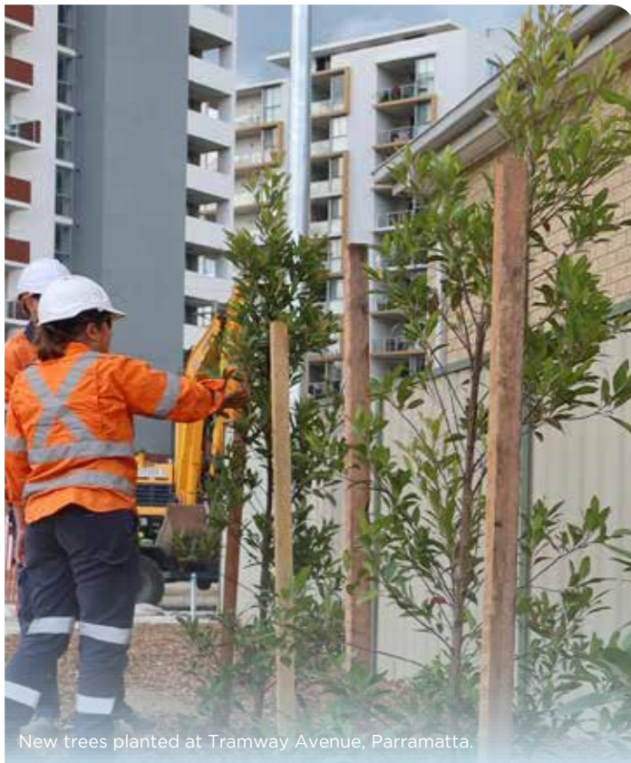
New trees planted at Tramway Avenue, Parramatta.