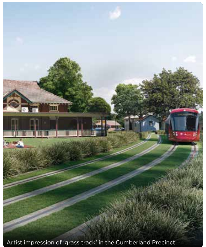
Artist impression of 'grass track' in the Cumberland Precinct.

Find out more: visit parramattalightrail.nsw.gov.au/isca-design-rating .