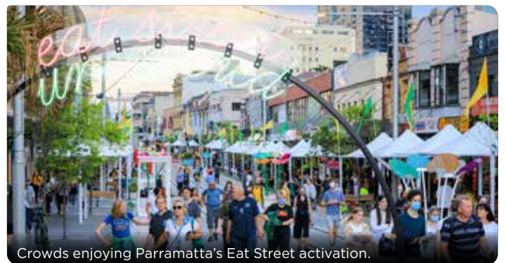
Crowds enjoying Parramatta's Eat Street activation.

Find out how you can win, visit activateparramatta.com.au .