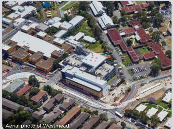
Aerial photo of Westmead.

With the temporary jetty removed near the new bridge in the Cumberland Precinct, the team is focused on constructing the shared walking and bike-riding path, and installing light rail track across the bridge structure.