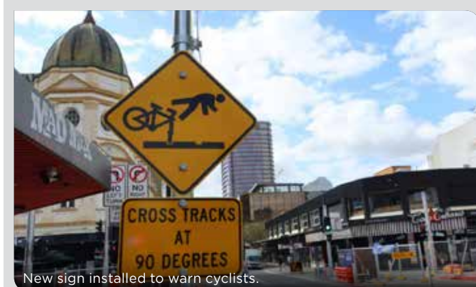
New sign installed to warn cyclists.