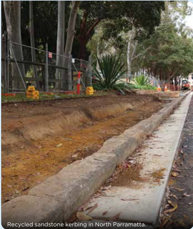
Recycled sandstone kerbing in North Parramatta.

The team highlighted its commitment to preserving Parramatta's rich cultural history by reusing century-old recycled sandstone blocks from the area for kerbing in North Parramatta and Cumberland.