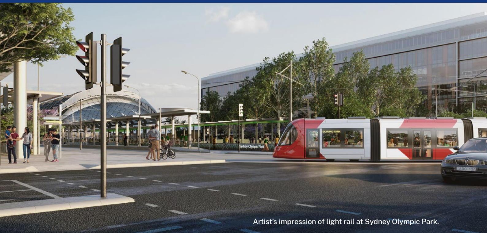
Artist's impression of light rail at Sydney Olympic Park.

Parramatta Light Rail Stage 2 is the NSW Government's latest public transport megaproject being delivered to serve a growing Western Sydney. Stage 2 will connect Stage 1 and Parramatta's CBD to Sydney Olympic Park via Camellia, Ermington, Melrose Park and Wentworth Point with a two-way track spanning 10 kilometres and 14 fully accessible stops.