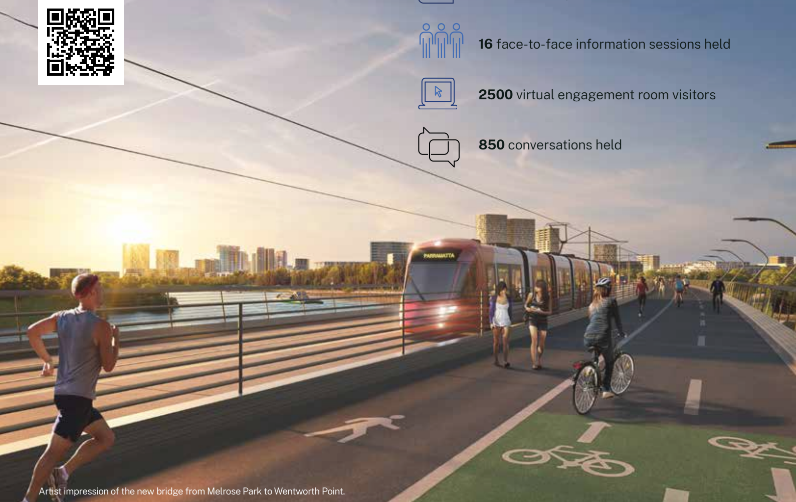
Artist impression of the new bridge from Melrose Park to Wentworth Point.