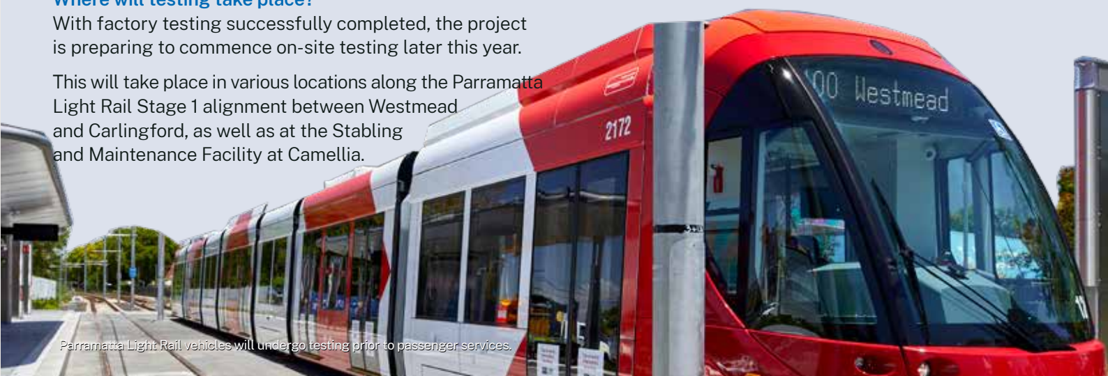
Parramatta Light Rail vehicles will undergo testing prior to passenger services.

Check our website regularly or follow our Facebook page for updates.