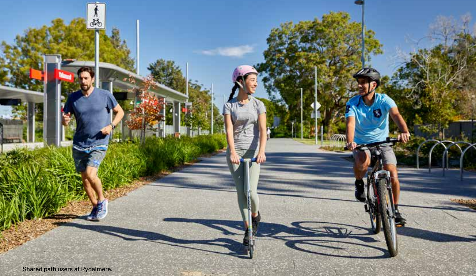
Shared path users at Rydalmere.