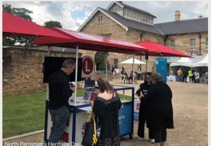
North Parramatta Heritage Day.

Visit parramattalightrail.nsw.gov.au/meet-the-team for upcoming dates, times and locations.