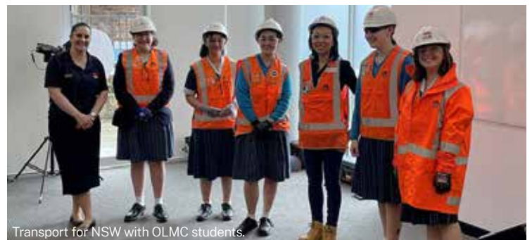
Transport for NSW with OLMC students.

Students from Our Lady of Mercy College (OLMC) in Parramatta had a unique and exciting opportunity to ask questions about pursuing a career in STEM (Science, Technology, Engineering, Mathematics), when Parramatta Light Rail representatives visited the all-girls high school earlier this year. Thanks to OLMC for the opportunity to encourage future careers for females in construction.