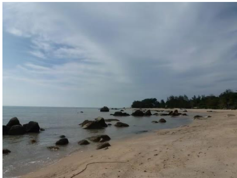
Figure 10 Cox AC (2015) Radji Beach today [photograph], Find My Past, accessed 10 May 2023.

https://australiannursesmemorialcentre.org.au/index.php/events/80th-anniversary-of-the-ss-vyner-brooke-sinking-bicton-wa-event/