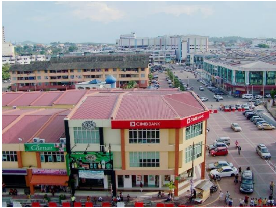
Figure 8 Kluang today (2023) [photograph], Wikipedia, accessed 12 May 2023.