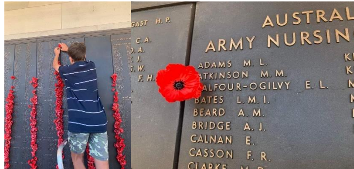
Figure 14 Files BF (2023) Putting a poppy in the sister Elaine-Balfour-Ogilvy memorial at the Australian War Memorial in Canberra [photograph], Ben Files, accessed 19 May 2023