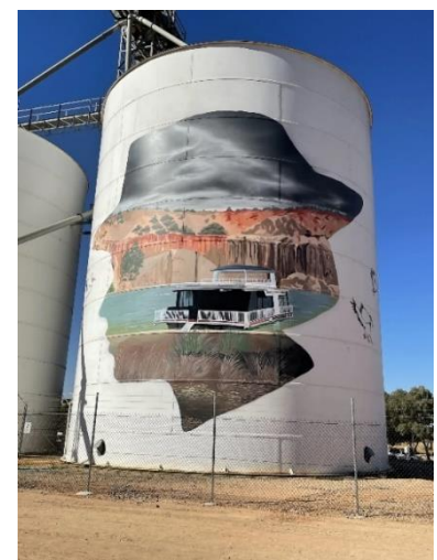
Figure 12 Annette Green AG (2021) Sister Elaine Balfour-Ogilvy silo art [photograph], Australian Silo Art Trail, accessed 12 May 2023.

https://recordsearch.naa.gov.au/SearchNR/Retrieve/Interface/ViewImage.aspx?B=6397185