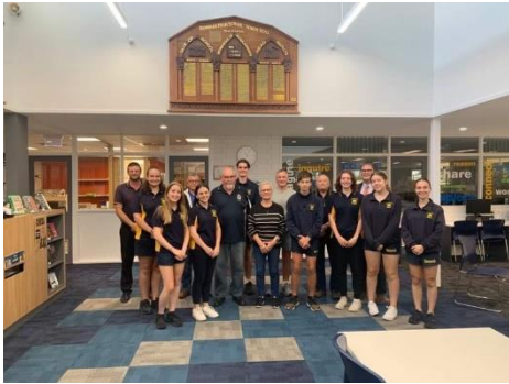
Figure 13 Group photo with the Vietnam War Veterans (front row 4th from the left) (2023) [photograph], Renmark High School, accessed 19 May 2023.