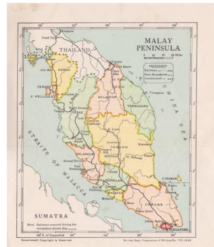
Figure 6 Map of the Malay Peninsula showing the Federation of Malaya, 1949 [illustration], Flickr, accessed 12 May 2023. https://www.flickr.com/photos/36844288@N00/15657073578