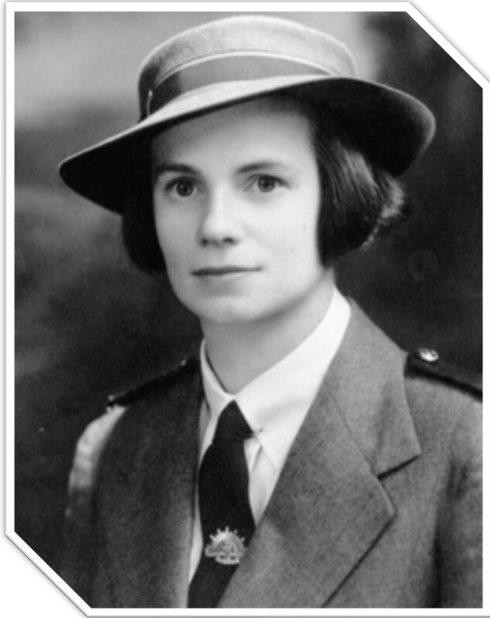
Figure 1 Elaine Lenore BALFOUR-OGILVY (2023) [photograph], Virtual War Memorial, accessed 9 May 2023. https://vwma.org.au/explore/people/12371

11 th of January 1912 – 16 th of February 1942