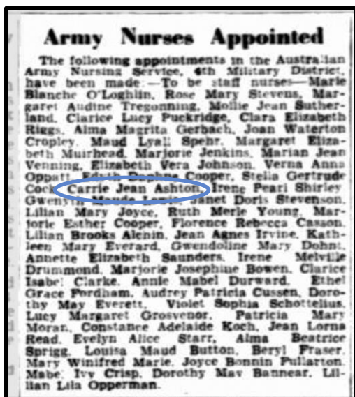
Figure 3: List of nurses from South Australia assigned for the Australian Army Nursing (The Advertiser) (Adelaide, SA : 1931 - 1954) Army Nurses Appointed Page 15 Thu 25 Jul 1940