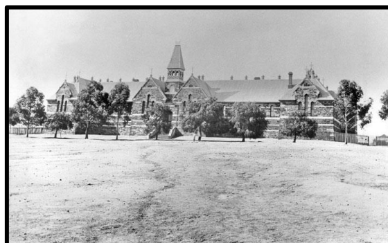
Figure 2: Burra Model School in 1912