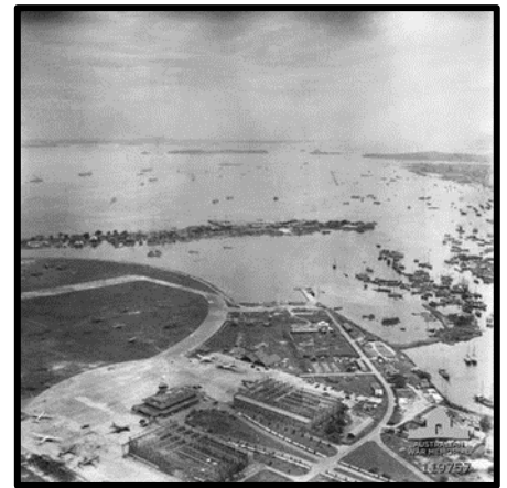
Figure 5: 1945-9-26 Aerial photograph of Singapore, showing bomb damaged civil airport with many allied transport planes.