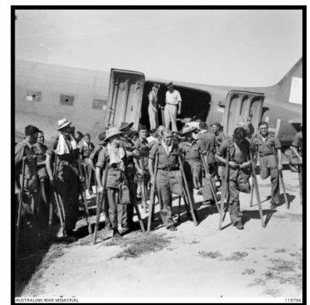
Figure 6: Singapore, 1945-09-25. Former POW Australian "Leggies" arrive at Kallang Airport from Bangkok Thailand.