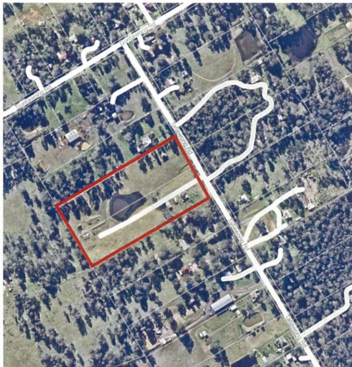
Figure 1 -Aerial Photograph of the site

This submission has been prepared by representatives of the landowners of 151 and 161 Tallawong Road, Rouse Hill (the site), being the Sikh Grammar School Australia, to provide comment on the Riverstone East Draft Precinct Plan. Specifically this submission seeks to reiterate the previous advice to the Department made by CGG Planning, dated 30 April 2014, in relation to the proposed future use of the site as a School and Place of Worship (refer Attachment A). The subject site is shown in Figure 1 below.