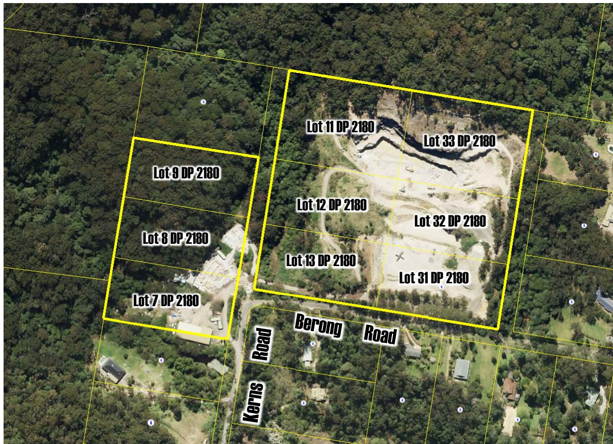
Diagram 2: Extents of Kincumber Quarry Site

There are examples within the Gosford and Wyong LGA's of former quarries which have been successfully rehabilitated into residential developments. In the early 1990's the Manooka Road precinct at West Gosford and the Sternbeck's Quarry site at Wyong were both successfully redeveloped in this fashion. Aerial images of both of these sites follow as Photo 1 and Photo 2 respectively.