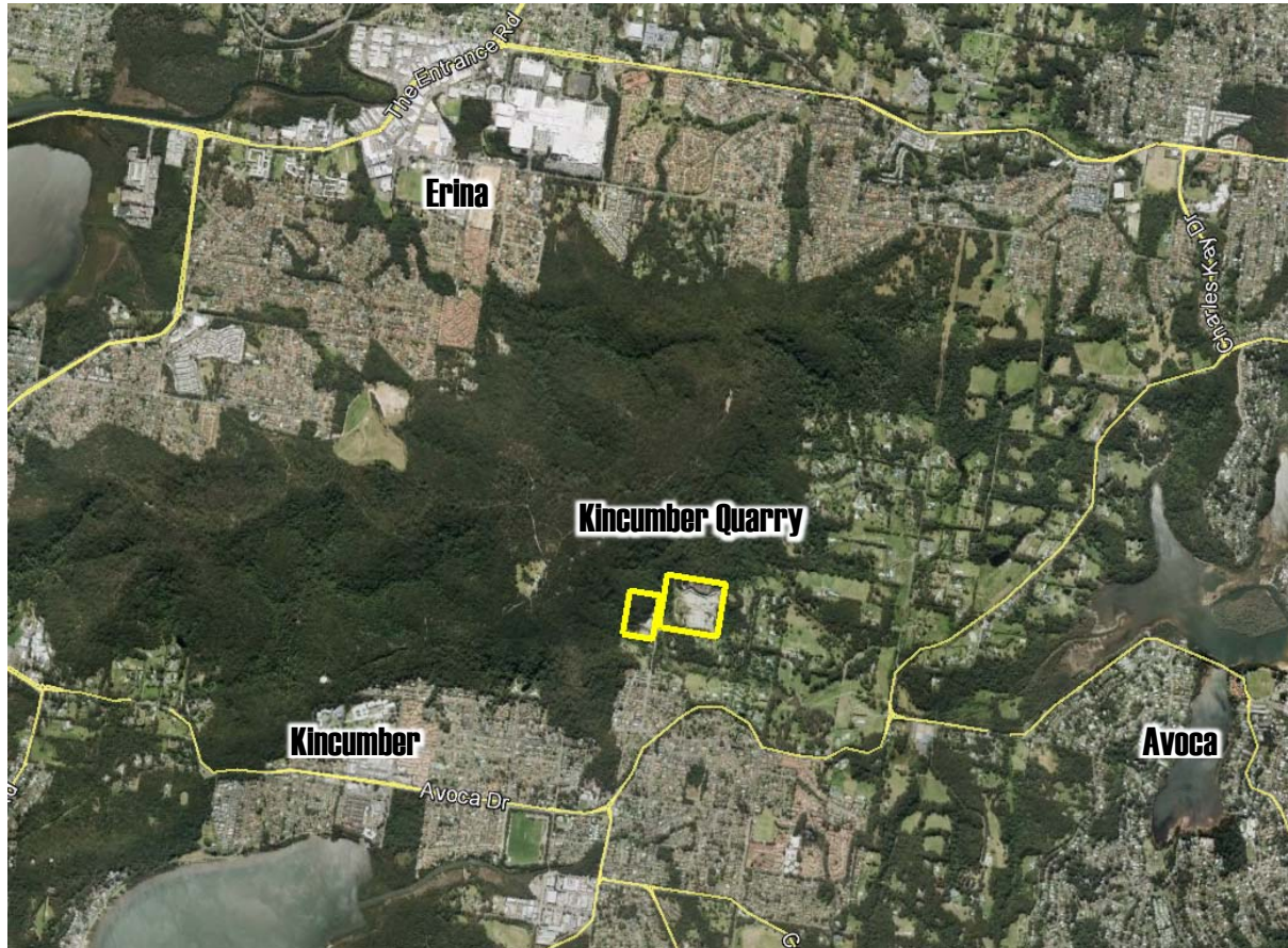
Diagram 1: Quarry relative to Kincumber locality

Diagram 1 shows that the site is well serviced with respect to existing urban services and major transport routes.