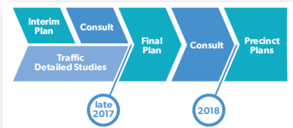
Figure 1: Excerpt from ILUIIP on process

The ILUIIP states that “Major landowners will prepare precinct plans in consultation with the Department and Wollondilly Shire Council” and that a “streamlined rezoning and precinct planning processes piloted in Wilton with the focus of delivering housing, jobs and infrastructure sooner”.