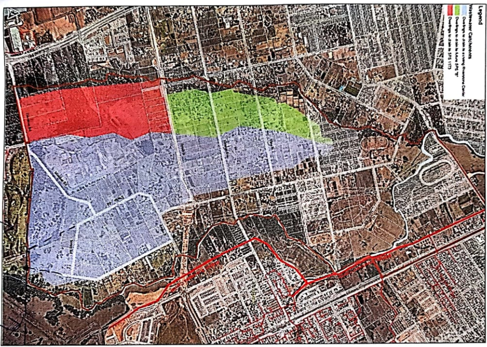
Figure 9 - Wastewater catchments

Flows within this catchment could be transferred by gravity to a future pumping station, SPS 'B'. As a result of the current planning position and associated funding routes, Sydney Water has advised that it has no committed timeframe for delivery of this pumping station and would unlikely be constructed before 2024 at the earliest, subject to funding.