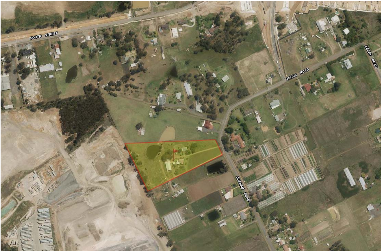
No.14 Lot 35, Durham Road locality plan