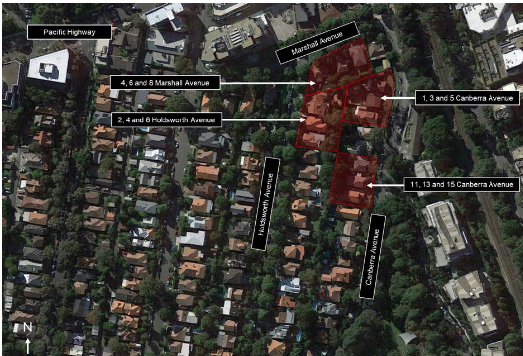
Figure 1: Sites owned by Piety THP within St Leonards South

Piety THP owns or has options over 12 lots within St Leonards as detailed in the Figure below. These sites are located within the boundaries of the draft planning package and the St Leonards South Planning Proposal (Planning Proposal).