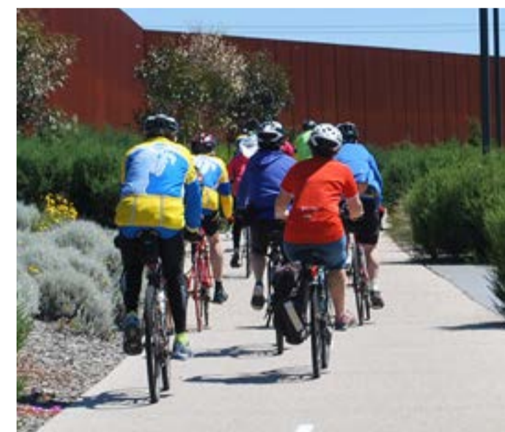
CONCRETE SHARED PATH