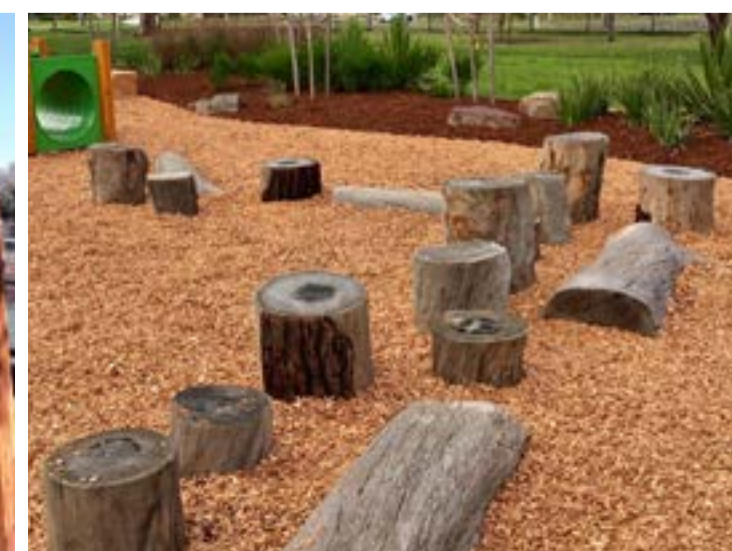
NATURE PLAY; LOGS, STEPPERS, AND MUSICAL INSTRUMENTS TIMBER BALANCE BEAMS