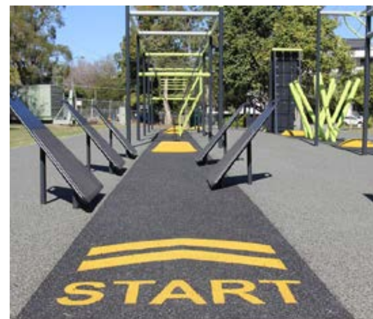
NINJA WARRIOR COURSE