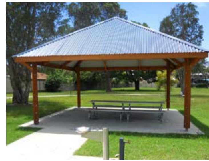
PICNIC SETTINGS AND BBQ

NOT TO SCALE PICNIC AND SPORT - IMAGES ARE INDICATIVE ONLY