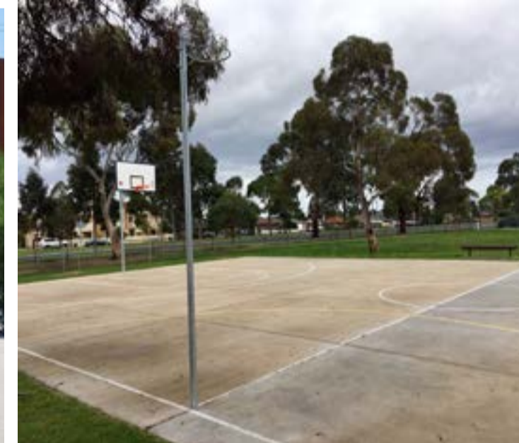
FULL BASKETBALL COURT