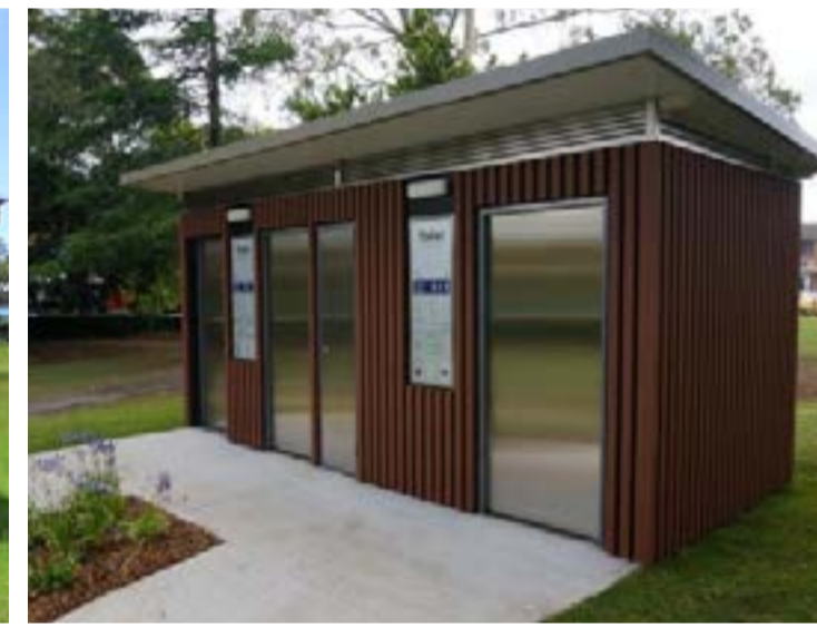
NEW TOILET FACILITY