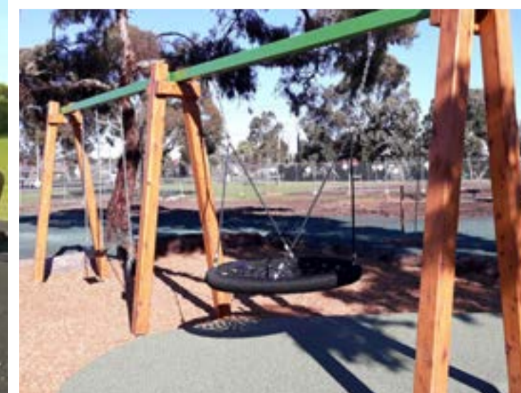
SWING SET INCLUDING BASKET SWING