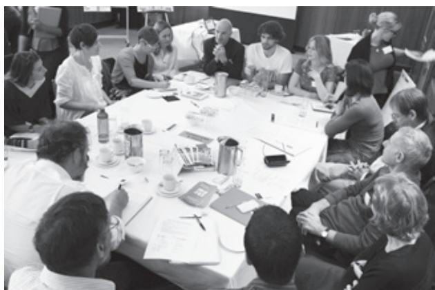
Roundtable Discussion, Carlton, 2013

Melbourne declares its intention to make research, student learning and engagement serve public ends. This includes taking up pressing societal problems in research, producing graduates prepared for responsibility, and promoting inquiry and open debate based on evidence and reason (University of Melbourne 2010:7)