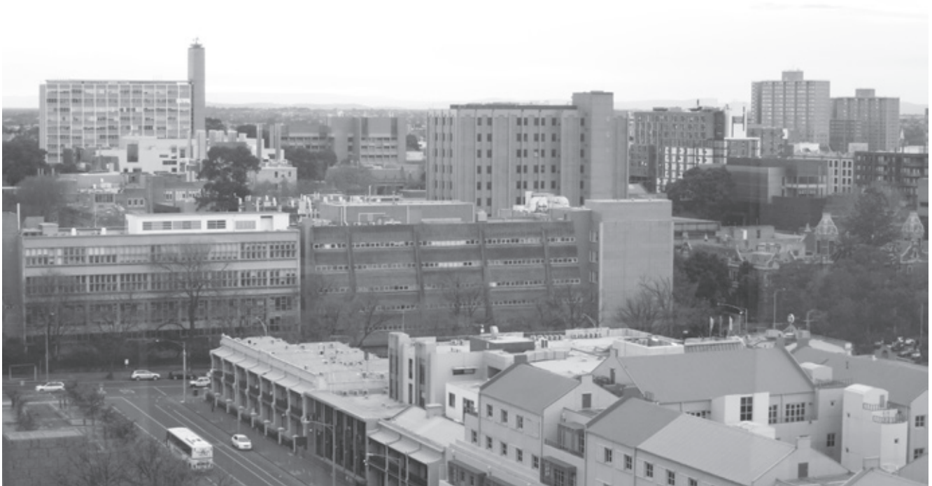
Part of the University of Melbourne's Parkville campus. The two towers on the right belong to the Carlton public housing estate.

These findings inform University engagement strategies to foster respectful, fruitful and sustainable partnerships with people and groups in the community experiencing disadvantage and marginalisation and for whom such partnerships can deliver many benefits.