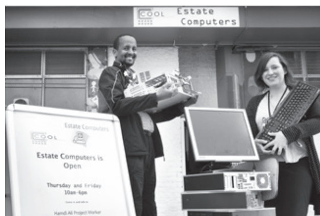
COOL and Estate Computers projects