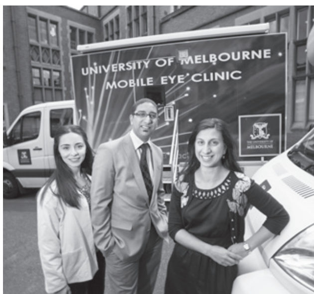
Free eye tests at Harmony Day, Carlton

This sort of engagement work will, I think, always suffer in relation to research and teaching, although it's supposed to underpin and support all of it. It is the kind of work that people, I always felt in a way that I was asking people to do favours rather than it being a really validated, like, valid, recognised piece of their work or part of the, you know, role, and if it didn't have immediate, say, research opportunities then, or if it didn't immediately help their students in some way, then it was a favour (UM staff 2).