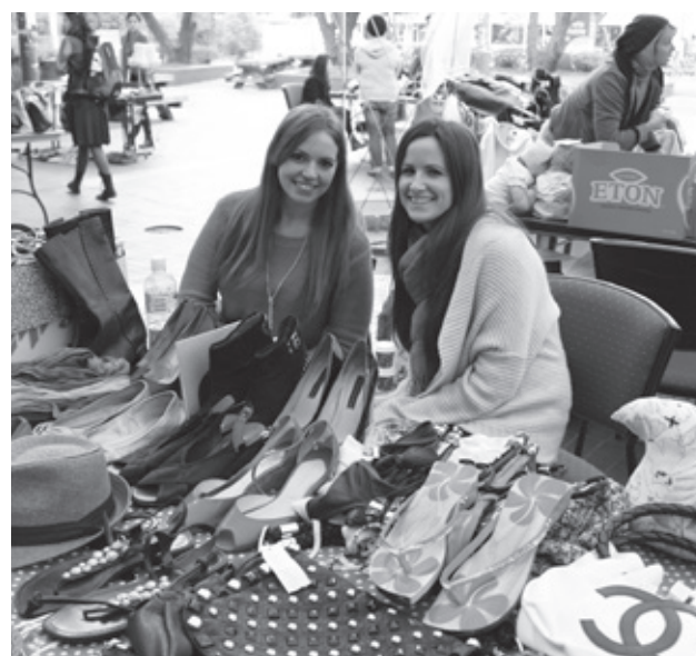
Garage Sale Trail

it was just such a very, a huge thing to grapple with, as to how could Melbourne University be involved. So there was always a lot of talk about volunteers and using the students as volunteers. [...] I know the acronyms change all the time with that section in the university that deals with student leadership – there was the SALP team and there were a few others that don't happen anymore and the staff have come and gone a lot I've noticed. So to me that was all very well, but those are things that had been happening already anyway (CW2).