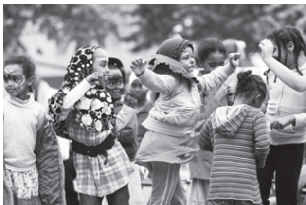
Harmony Day, Carlton, 2011

With regard to the need for a long-term commitment from the University, the informants were agreed that if the support of the partnership consultants were withdrawn there are high risks that the relationships that have been developed would atrophy or be lost. Small, poorly-funded organisations do not have the resources needed to build and maintain relationships that are not absolutely essential for meeting their service obligations.