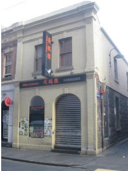
Figure 3. 212 Little Bourke Street constructed 1883.

A two-storey brick building, one of a row of three, built 1883. The building retains its simple Victorian detailing at the upper level but has been altered at ground level.