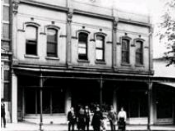
Figure 1. Café d'Italia Restaurant, c1922.

and a single storey extension made to the rear of the building (Erlich 2008). The subject site presently hosts three separate eating establishments in the ground floor, two occupying the original buildings, and the third located in the new addition to the rear of the lot. The upper level now houses an office (CoMMaps).