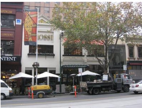
Figure 6. 78-84 Bourke Street constructed 1860 and 82-84 Bourke Street constructed 1922.

A two-storey brick building incorporating two former shops. 78-80 Bourke was built in 1860 and 82-84 Bourke was built in 1922. The buildings were incorporated in 1944. The building has a long association with Italian wine bar/restaurants. In 1871, a wine bar was established on the site, and in 1928 a café named Café Florentino was established. The renowned Italian restaurant Grossi Florentino has operated from the site for several decades. ( http://www.grossi.com.au/history )