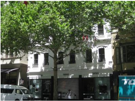
Figure 5. 73-77 Bourke Street constructed c1880.

A row of three three-storey brick shops built around 1880. The building retains its Victorian detailing at the upper level but has been altered at ground level.