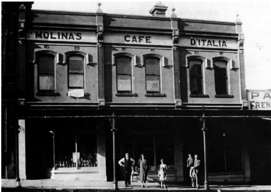
Figure 2. Molina's Café d'Italia, c1925, showing new signage.