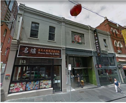
Figure 4. 113-117 Little Bourke Street constructed 1882.