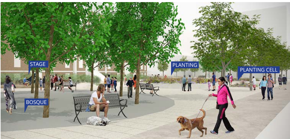
View looking north from South St.