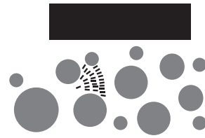
Yoga: 25 people