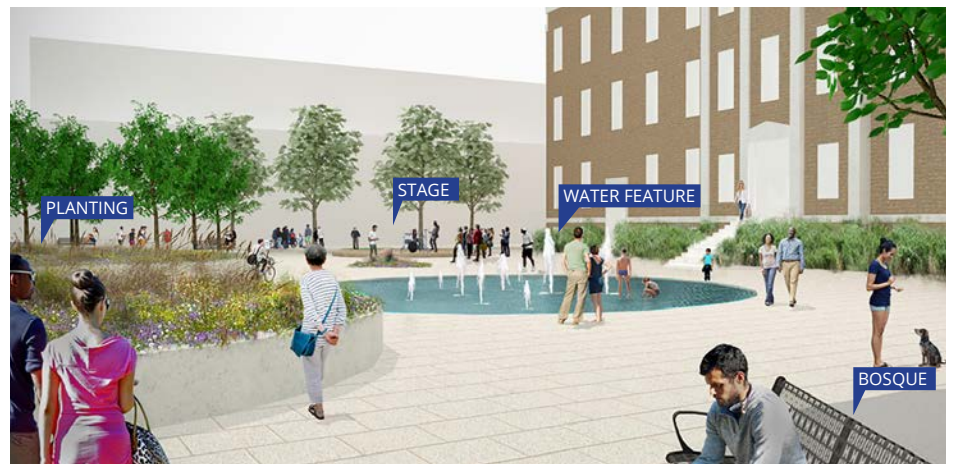
View looking west from South St. and Colborne St.