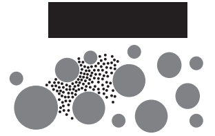
Concert: ~250 people