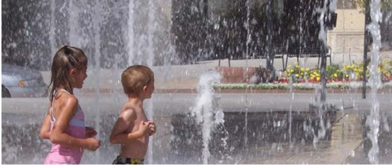
Recreational use of a water feature.