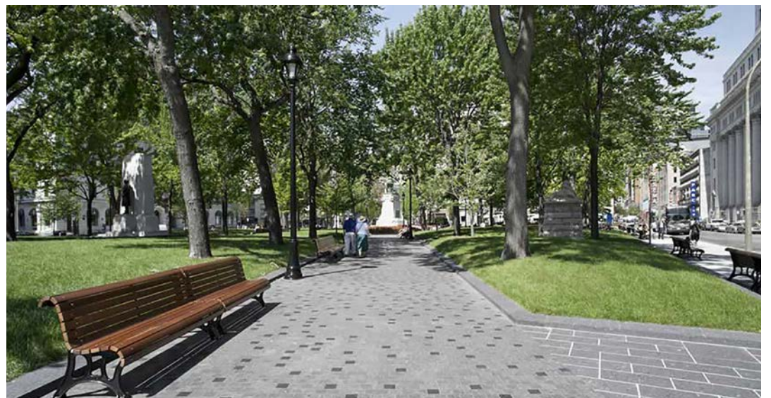
Dorchester Square, Montreal.