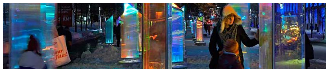
Temporary art during the winter, Place des Festivals, Montreal.