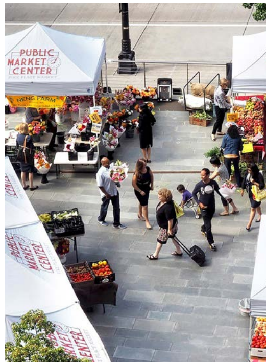
Temporary events: farmer's market, Seattle, Washington and Kingston.