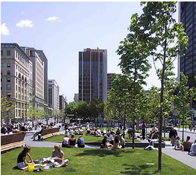
Passive gathering at Victoria Square in Montreal.