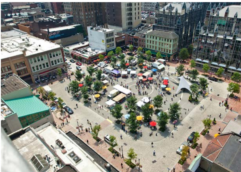
Market Square, Pittsburgh, Pennsylvania.