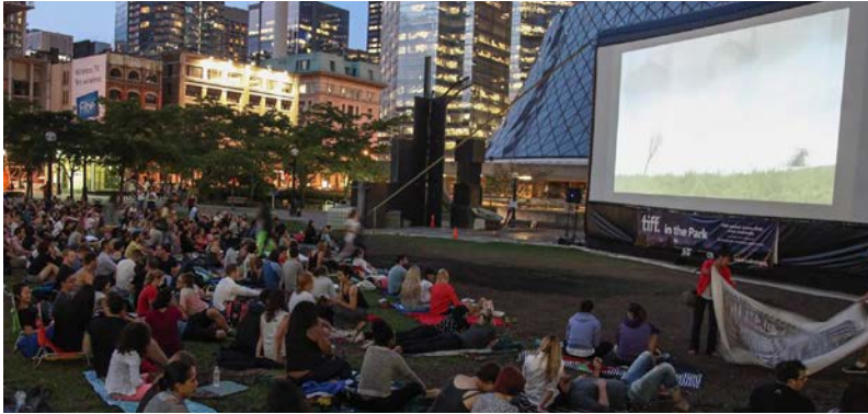
David Pecaut Square, Toronto.