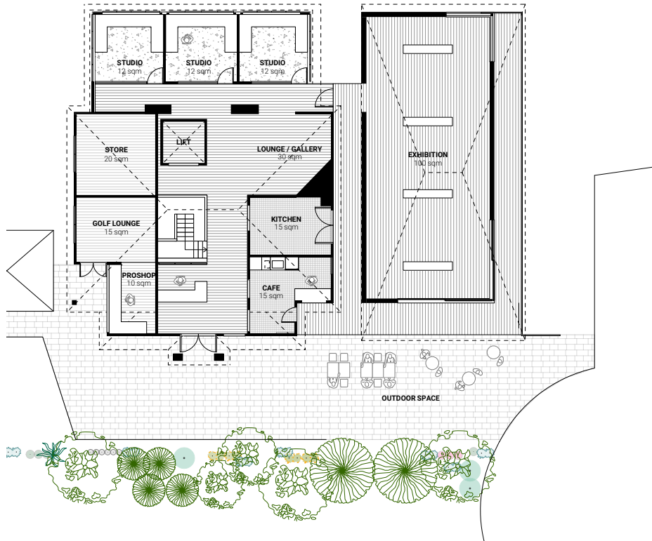
Avalon Golf Club, Proposed Ground Plan 1:200 @ A3