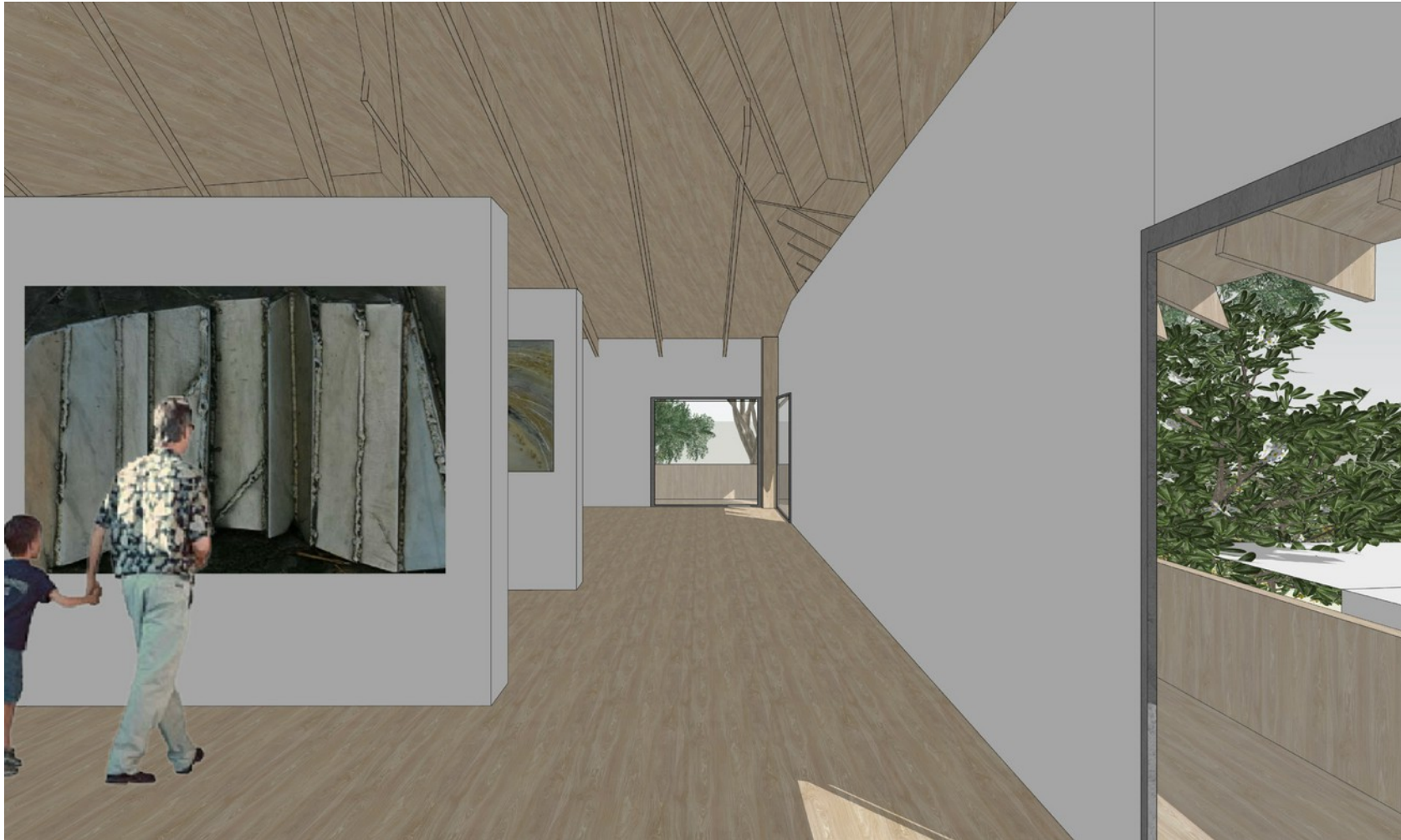
INTERIOR VIEW LOOKING THROUGH EXHIBITION SPACE WITH HIGH VOLUMETRIC SPACE