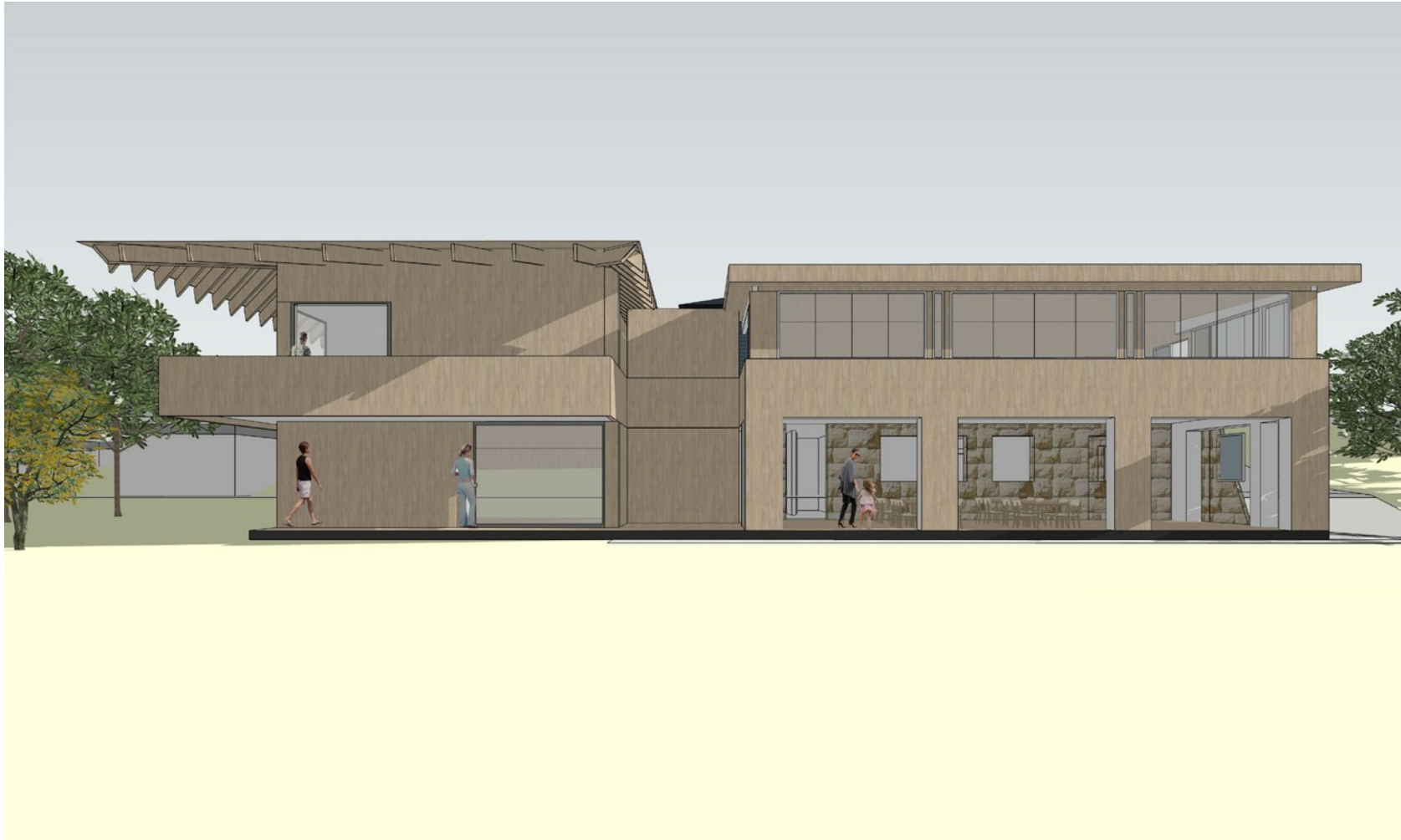
VIEW LOOKING FROM GOLF COURSE INTO EXHIBITION, TEACHING AND COMMUNAL SPACES