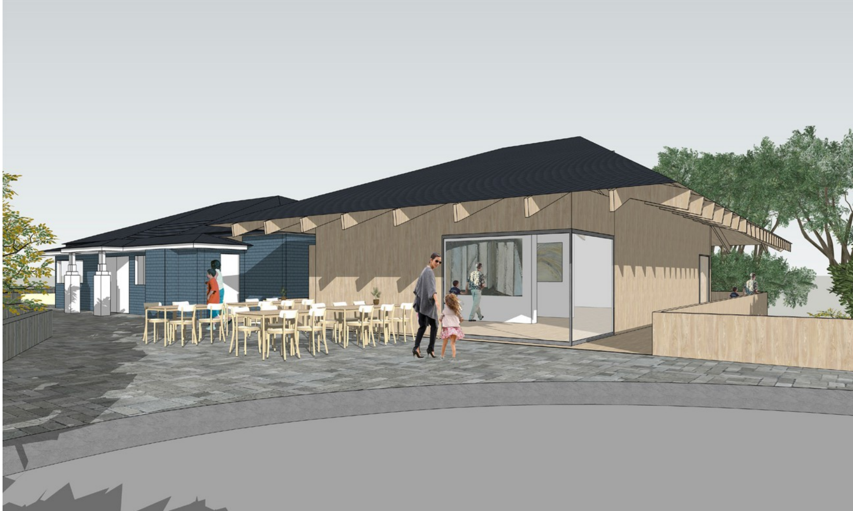
VIEW LOOKING FROM CARPARK TO OUTDOOR CAFE AND EXHIBITION