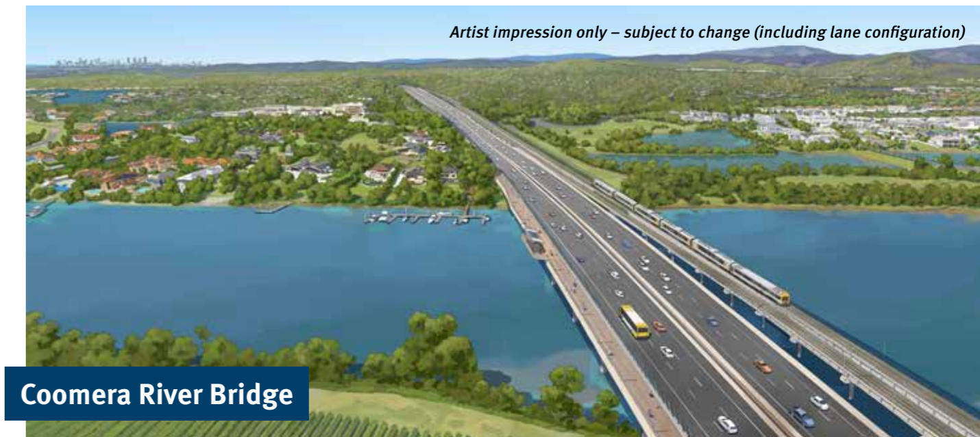
Artist impression only – subject to change (including lane configuration)