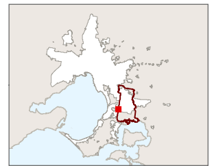
Part of Planning Scheme Map 14SCO