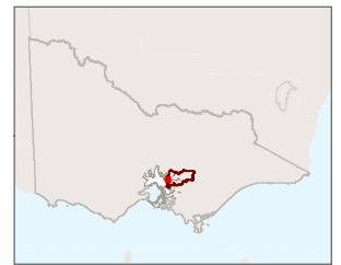
Part of Planning Scheme Map 40PAO