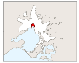
Part of Planning Scheme Map 4EAO

Disclaimer This publication may be of assistance to you but the State of Victoria and its employees do not guarantee that the publication is without flaw of any kind or is wholly appropriate for your particular purposes and therefore disclaims all liability for any error, loss or other consequence which may arise from you relying on any information in this publication.