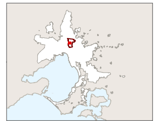
Part of Planning Scheme Map 11DCPO