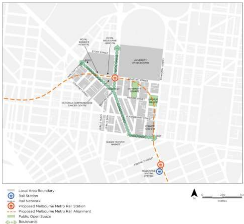
Figure 10: CityNorth

This area’s potential for urban renewal (as an extension of the Central City) is currently being planned utilising the directions from the Council adopted City North Structure Plan 2012. This amendment is still to be inserted into the planning scheme.