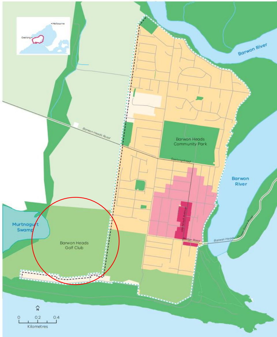
Map 12: Proposed Barwon Heads protected settlement boundary