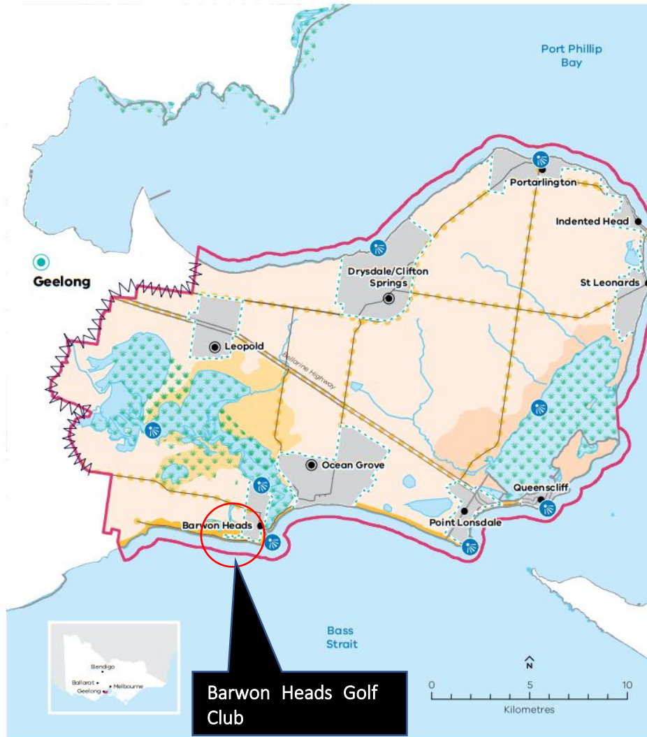
Map 4: Landscape significance areas