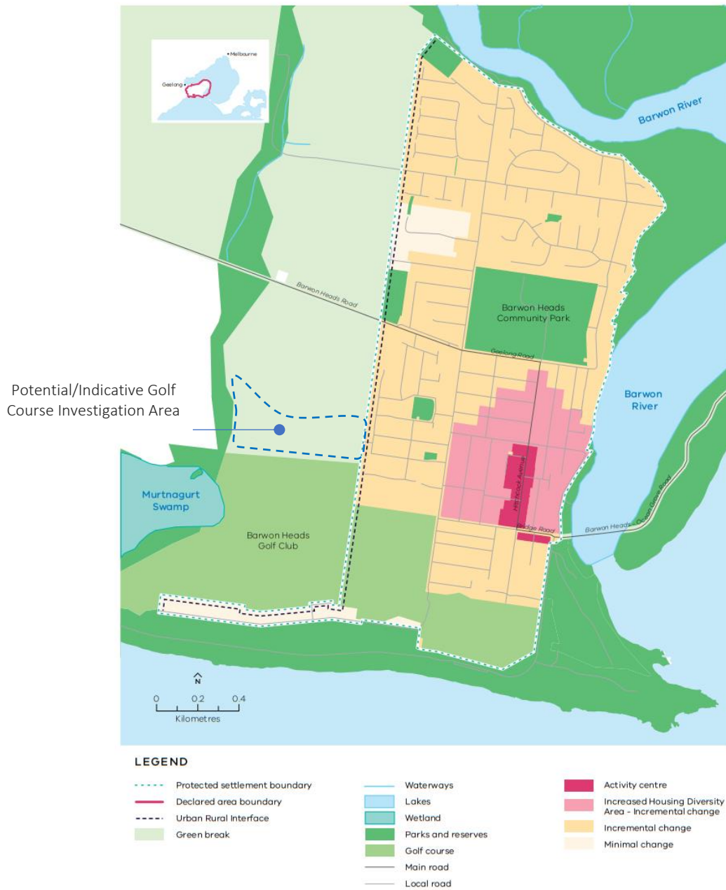
Map 12: Proposed Barwon Heads protected settlement boundary