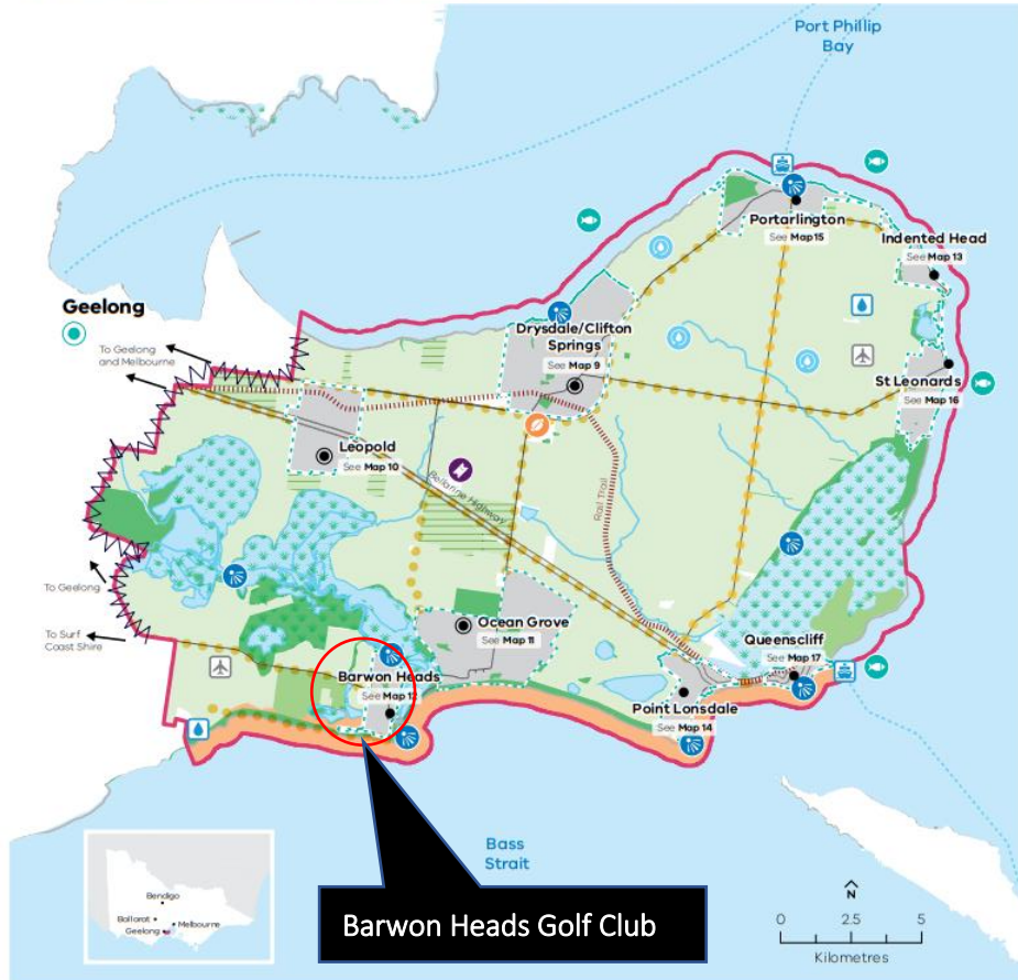
Map 3: Proposed Bellarine Peninsula declared area framework plan