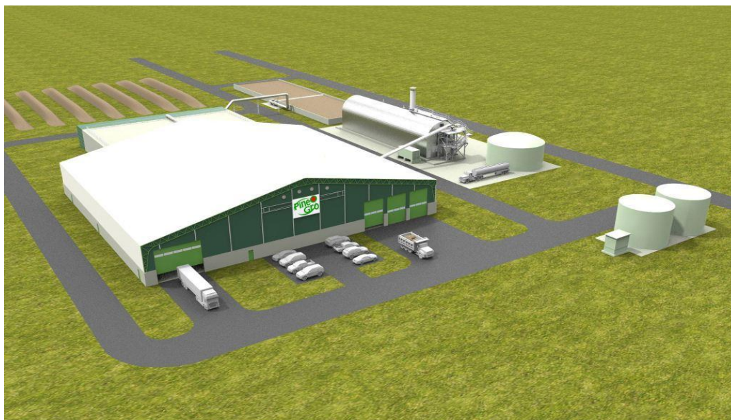
Proposed Invesel Compost Facility – Morwell

Establish an Environmentally Sustainable Composting Facility utilising Proven Best Practice Technology